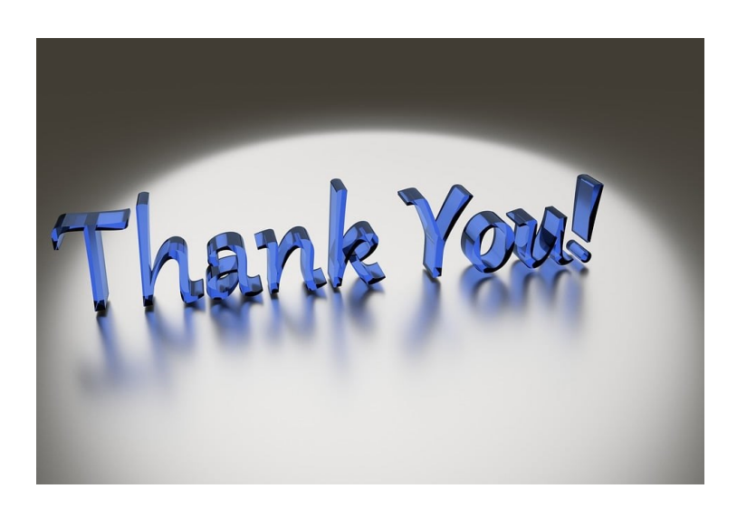
Thank you to everyone who pitched in to help our community stay the beauty it is!

If you see items needing repair, let us know! Volunteers are always welcome to pitch in!