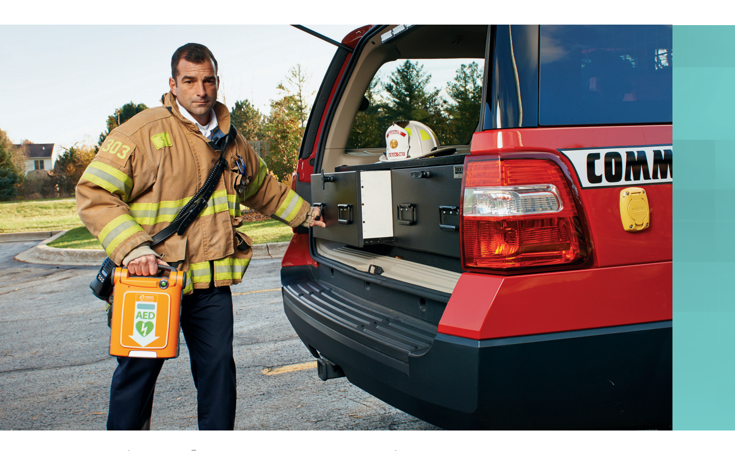
Powerheart® AEDs in Fire and EMS