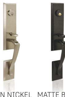
SATIN NICKEL MATTE BLACK