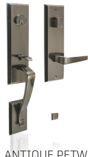
ANTIQUE PETWER (SHOWN WITH INTERIOR TRIM)