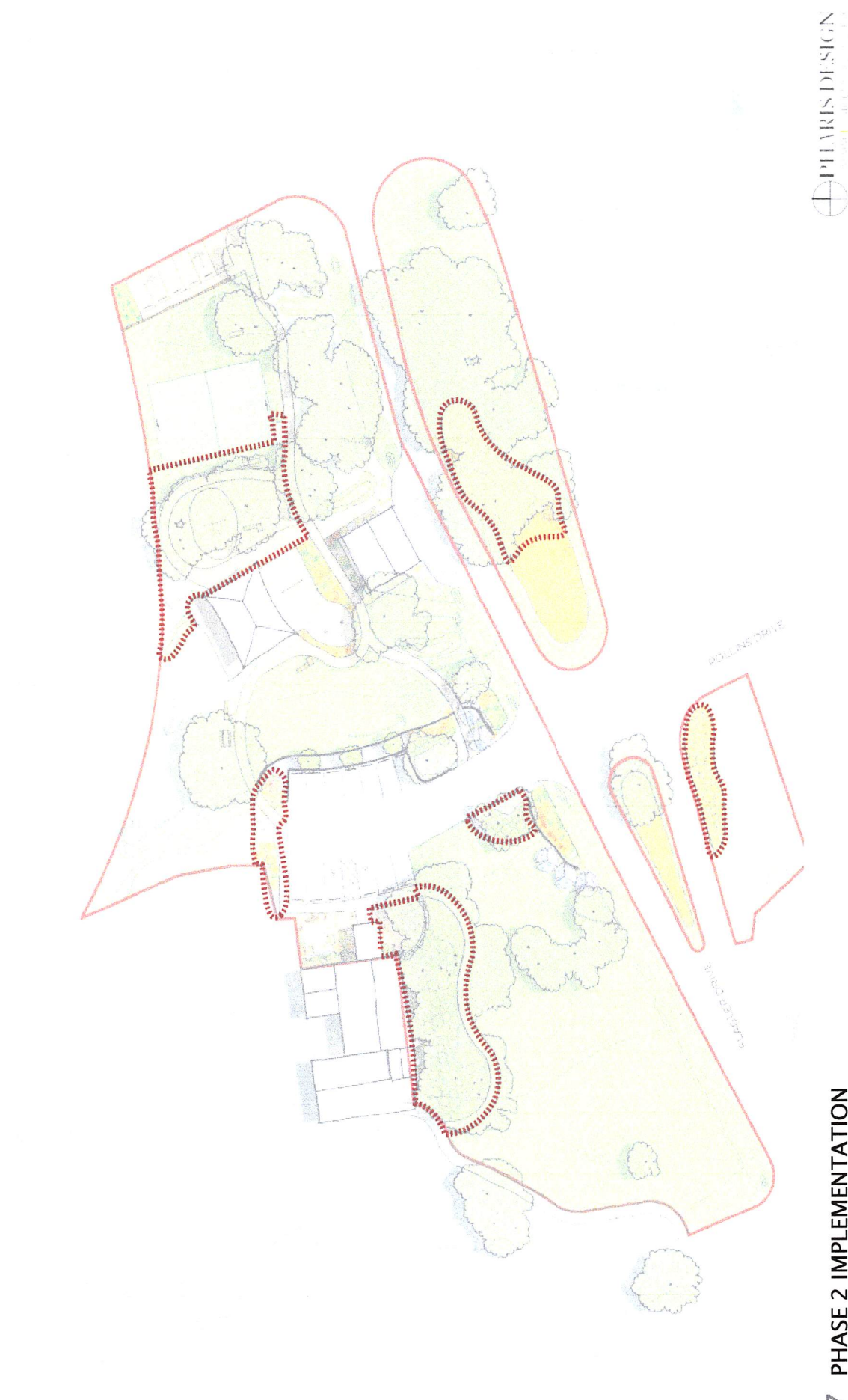
7 PHASE 2 IMPLEMENTATION