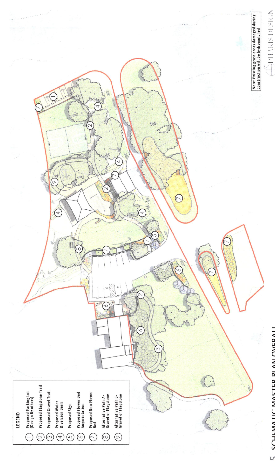
SCHEMATIC MASTER PLAN OVERALL