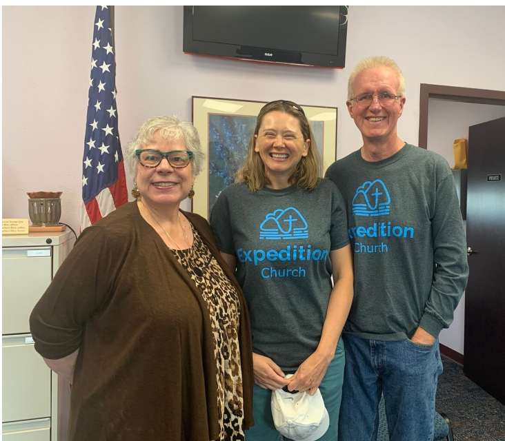
Pre-Church Plant Work - Meeting Whitehall Mayor Mary