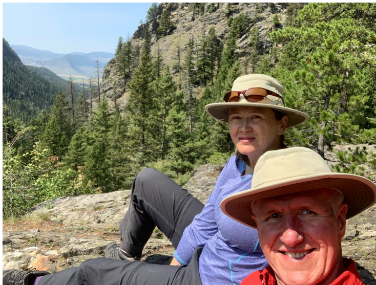
Overlook into Paradise Valley from Pine Creek Trail

is bursting at the seams with young families and children. Their church meets in a small rental space and recently went to 2 Sunday morning services to provide room to grow! We were able to encourage them and assist with organizing their children's ministry area, storage unit, assist with preparation for their October "Candy Jam" Outreach, and advise them regarding their future ministry real estate needs. Capstone is reaching new people for Christ in a rapid growth area of Montana.