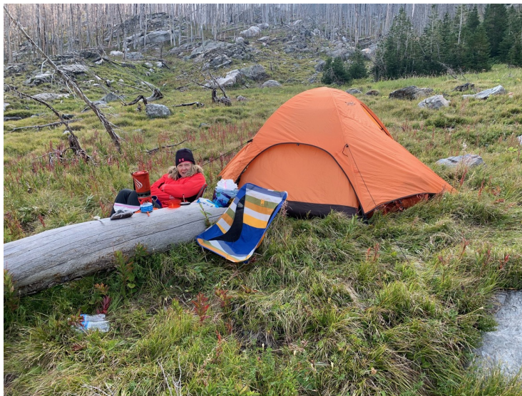
Off trail near Pine Creek in Custer Gallatin Nat'l Forest & Absaroka Mountain Range

Our plan was to hike up to the lake and camp then come back down the next day but the (unnamed) Dooley Expedition Leader took a wrong turn once the trail crosses a mountain stream so we took the hard way up. Carrying our 30 lb backpacks (including our new bear canister meant to keep safe anything that would attract a bear-besides us :-)) we climbed for 3 hours to only go 1/2 mile and ended up camping for the night on a knoll overlooking Paradise Valley.