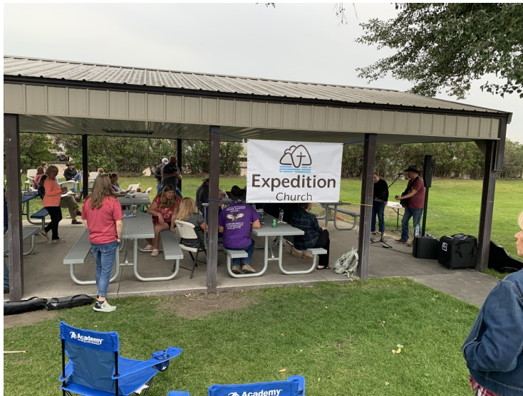
Pre-Church Plant Worship Gathering, Whitehall, MT

Footnote: Thank you to our friends and fellow agents at Iron Gate Real Estate for helping us continue to do Real Estate business while we are deployed to MT!