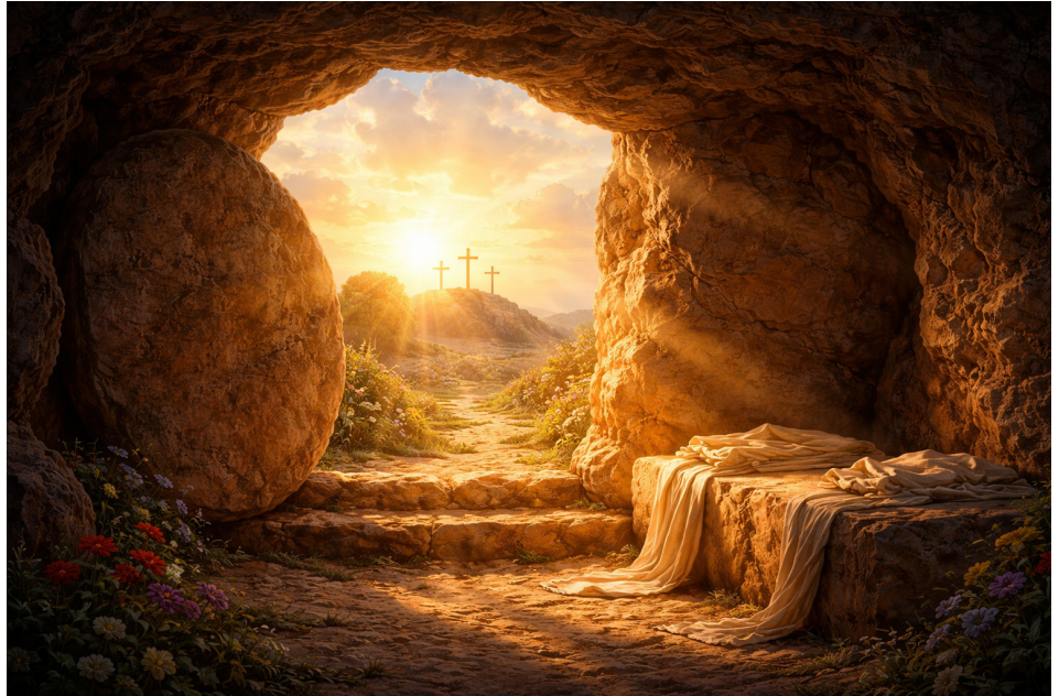
Graphic via Chat GPT

Easter is the celebration and recognition of the empty tomb, the Resurrection of Jesus. For some it is the celebration of Jesus Christ's resurrection, symbolizing victory over sin and death, renewal, and new life. But Easter can have many different meanings for us personally. It is also a season of fifty days. The original purpose of the Easter season was to continue the formation of new Christians in the faith.