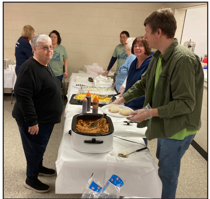
Scenes from the March Free Meal