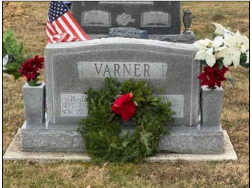
A wreath from last year's Wreaths Across America

If you would like to participate, we will be placing the wreaths on Saturday, December 16, at 9 a.m.