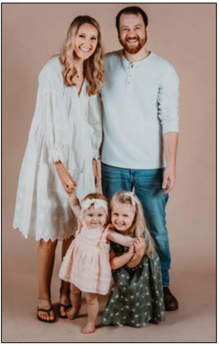
What does your family like to do to relax?

2 Corinthians 4:18 is a great reminder that what we face here on Earth is temporary. We have a wonderful home in heaven that awaits us.