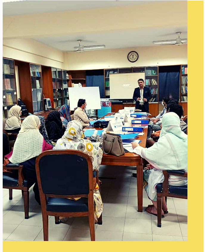
Low Vision Training Workshop at Khairunnisa Eye Hospital:

Brien Holden Foundation, An International Non-Governmental Organization conducted a five days training workshop on " Clinical and Functional Low Vision Management " at LRBT Hospital Karachi where Khairun'nisa Eye Hospital Staff actively participated. This training workshop aimed to strengthen the knowledge and skills of Optometrists involved in Low Vision treatment and management.