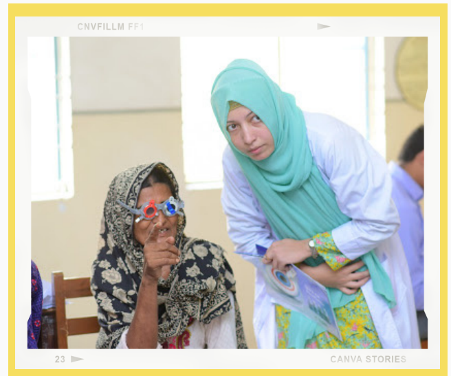
An optometrist checking patients' eye sight .