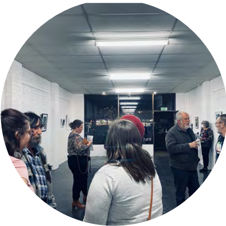
Building a network