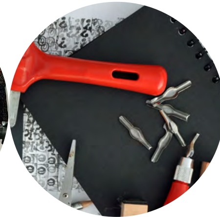
Workshops & classes