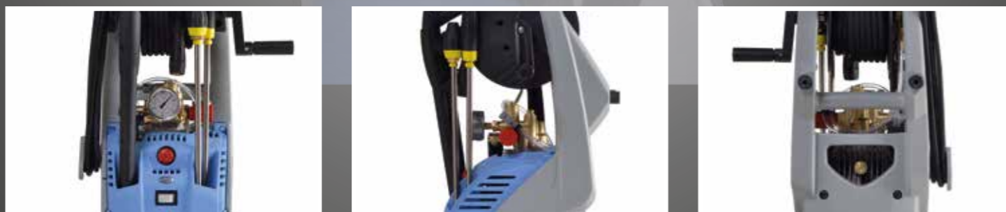
Figures: K 1152 TST