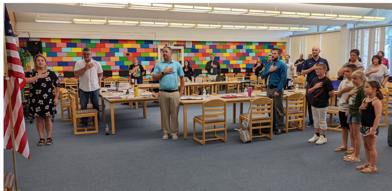
Elementary students led the Pledge of Allegiance at board meetings all year long.