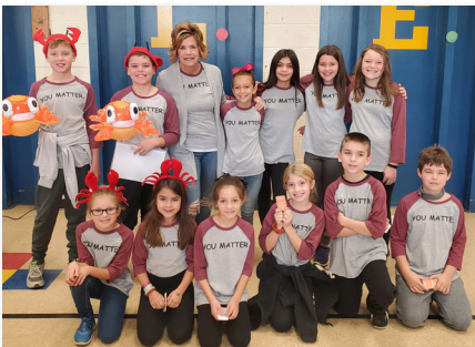
Elementary Student Council sponsored a "Look for the Good" campaign.