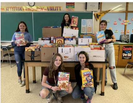
Middle School Student Council held a large cereal drive for families in need.