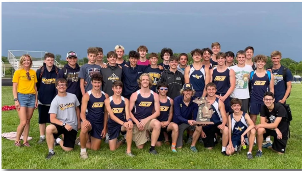
Erie-Mason Boys Track & Field Team

Another successful spring sport season has come to an end! All student-athletes and coaches put in a great effort and displayed a high level of sportsmanship throughout the year. Great work, Eagles!