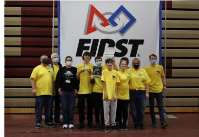
The High School Robotics team wins the Rookie Inspiration Award.