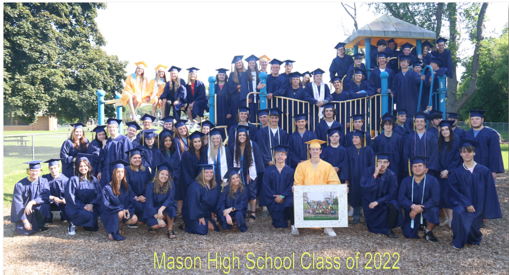
Mason High School Class of 2022

Goodbye and good luck to our Class of 2022! Get out there and SOAR, Eagles!