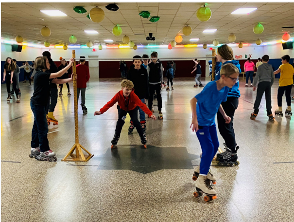
Students playing limbo at a roller-skating incentive

This fall we will reintroduce our Eagle Power Hour! During this class, teachers will be implementing a variety of team-building and school culture activities that reinforce important values like unity and diversity, address issues such as peer conflict, and promote teamwork, leadership, and empathy. All of these strategies are proven to reduce symptoms