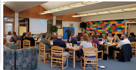
The Strategic Planning Committee held an all-day group brainstorming session.