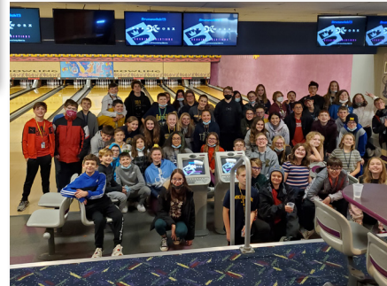
Middle School students at a bowling incentive for the PBIS program! (more on pg. 5!)