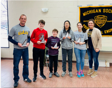
Middle School Math Counts team wins first place in the Regional competition!

Looking back on another year ending at Mason, we can smile at all of the wonderful things our Eagles have accomplished!