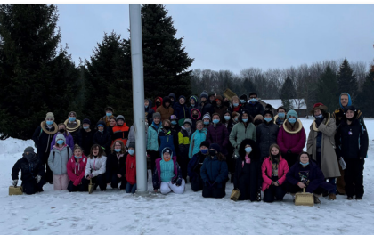
Elementary School students at Camp Storers.