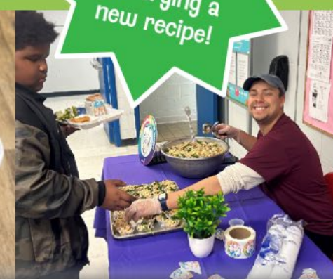
Spinach Pasta Salad

Wellness Wednesday offers delicious and nutritious recipes that encourage students to try whole-some foods that they might not typically consider.