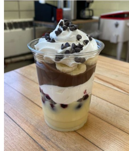
Pictured above is the LTO Berry Banana Pudding Sundae that was available at the MS/HS Ala Cart Station.