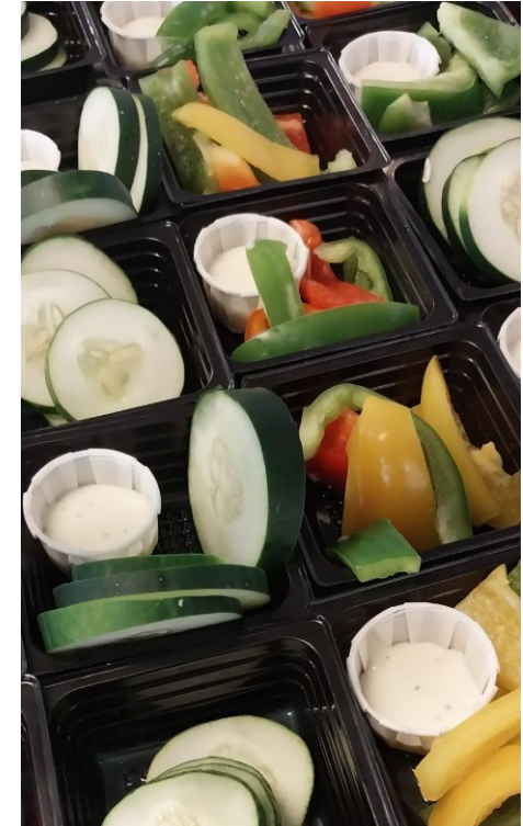
Right: Fresh cut vegetables at Central.