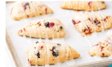
Mixed Berry Scone Dough