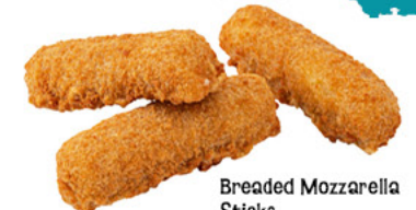
Breaded Mozzarella Sticks

Delivering delicious, safe, and high quality products everytime!