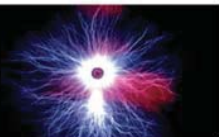
KIRLIAN PICTURE Negative Ions

The gemstones Tourmaline and Amethyst are known to emit negative ions. Negative ions are invisible, odorless molecules that we come into contact with in certain environments including evaporating water, ocean surf, and around waterfalls.