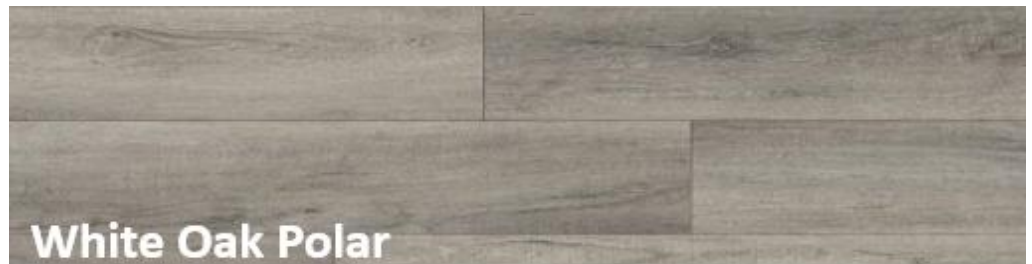
White Oak Polar