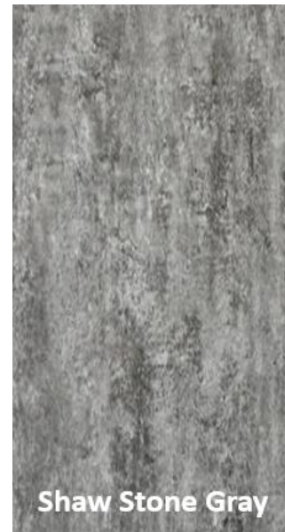
Shaw Stone Gray