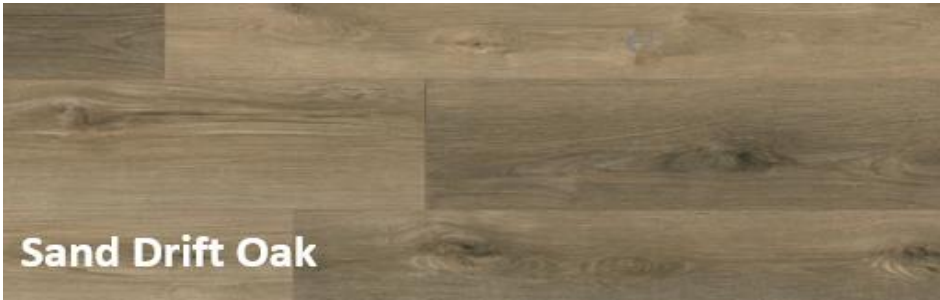
Sand Drift Oak