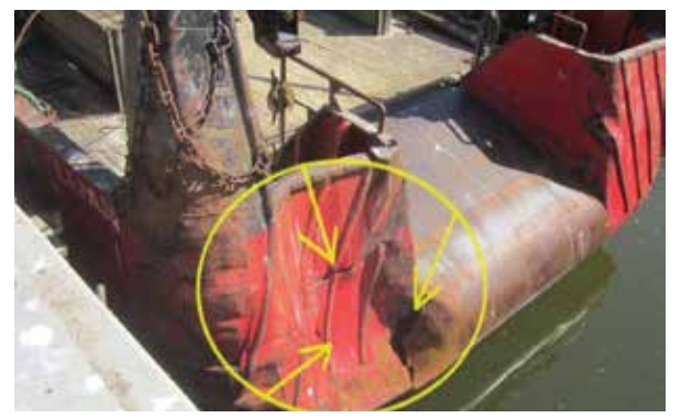
Collision damage to fishing vessel

The cargo vessel did not respond to further calls from the fishing vessel and kept its course and speed as if nothing had happened. The subsequent investigation by authorities found the following entry in the cargo vessel's logbook; 'small collision with fv'.