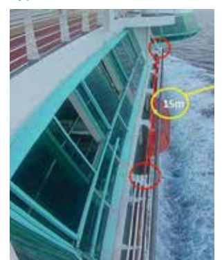
15m section with no dedicated catwalk or secure anchor rail

Contradictions of this sort are a strong signal that procedures can be bypassed and are not conducive to a strong safety culture.