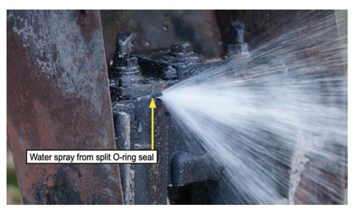
Post-accident test using water to simulate fuel spray