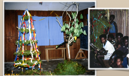
Christmas trees - notice tree from the Garden of Eden with snake and fruit