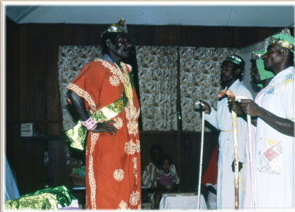
Christmas play - Herod and wise men