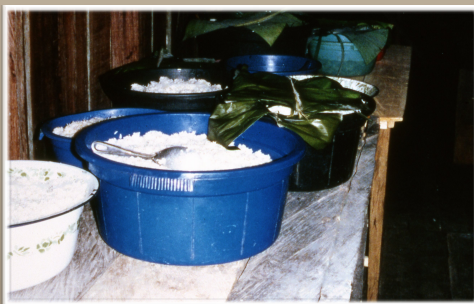
Christmas feast - Rice