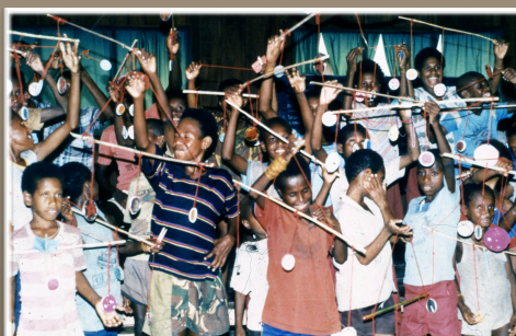
Christmas ornaments - tin can lid on