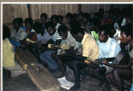
Orchestra with home made instruments. Strings are fishline