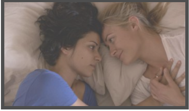
All About E (US DVD Review) In "GAY FILM REVIEWS"