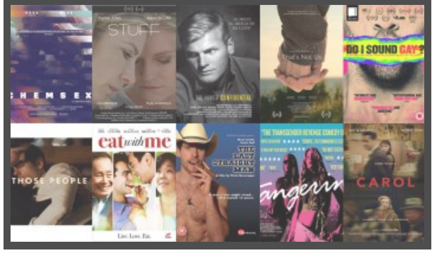
Big Gay Picture Show's Top 10 LGBT-Themed Films Of 2015 In "FEATURED SLIDESHOW"