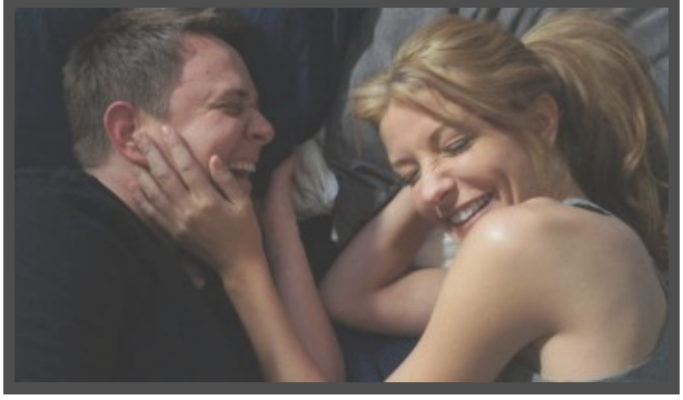
Heterosexual Jill (VoD Review) In "GAY FILM REVIEWS"