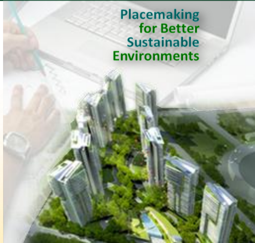
Placemaking for Better Sustainable Environments