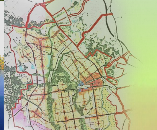
Placemaking for Better Sustainable Environments

T 755-9042 M1 +63949.364.2132 M2 +63917.852.4479 E tap.greenedge@gmail.com