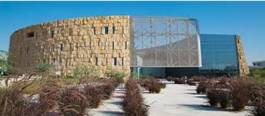
Design Architect Antoine Predock

Decorative yet functional gravel drains merged with the overall xeriscape esthetic for the entire campus.