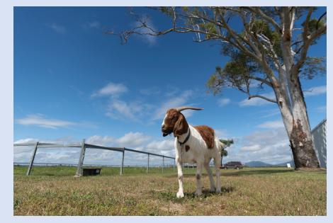
Sustainable Farming With Goat Silvipasture at TSI

With proof of concept top of mind, Sebastian's first production batch from the Avr agaves "contained all of the signature agave profile we wanted which proved to us that a distilled 100% Australian Agave Spirit was possible and most importantly tasted great." While the Agave Tequilana is the same plant as that used in the distillation of Tequila, "our agave has acclimated to Australia, specifically Queensland's dry tropical north, and has consequently developed a flavor and character that is unique to the world." says Sebastian.