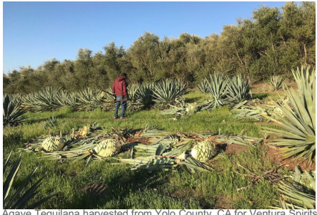
Tequilana harvested from Yolo County, CA for Ventura Sp

"Our hope is to make a small contribution to the rich tapestry of Agave Spirits by producing the purest expression of agave flavor possible," adds Henry, "while giving spirits distilled from California grown agave their own unique character."