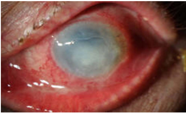
Fig. 1. Large central corneal infiltrate with sharp borders moderate thinning, and an associated epithelial defect.