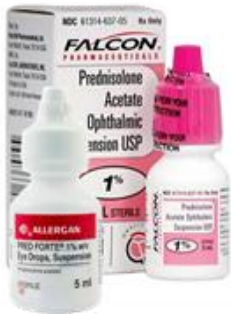
Prednisolone/Pred Forte (pink or white top) One (1) drop every two (2) hours