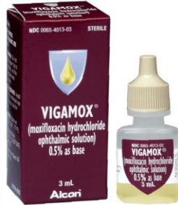
Moxifloxacin/Vigamox (beige/tan top) One (1) drop every four (4) hours