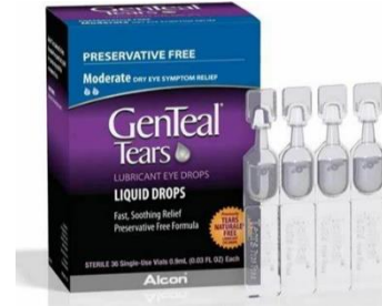
Preservative Free Artificial Tears (single-use vials) One (1) drop every four (4) hours