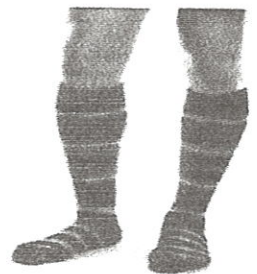
Therafirm Core-Spun Light Support Patterned Socks -

"Your One-Stop, Locally-Owned Medical Supply Company."