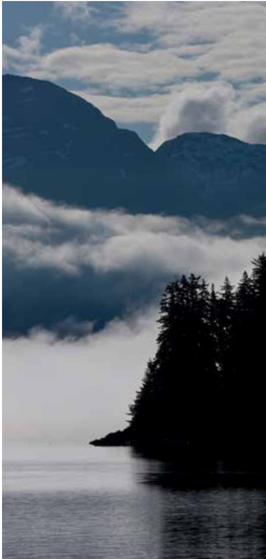
Admiralty Island is the world's largest remaining expanse of intact, old-growth temperate rainforest.

The mine would be able to operate as long as it did not create "irreparable harm" to the Monument's historic, prehistoric, scientific, ecological, and cultural values. The primary cultural values protected under ANILCA are traditional, cultural subsistence activities. Specifically, ANILCA requires mining operations to protect anadromous streams and food fish habitats and to not limit subsistence opportunities. Hawk Inlet is within the traditional subsistence fishing and gathering areas of Angoon, Hoonah and Auk Village (Juneau) Tlingit Indian villages that have depended on the island for thousands of years.