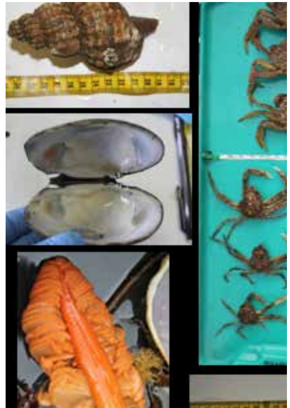
The Friends of Admiralty Island study analyzed tissues of key species of marine animals that typify the food chains in Hawk Inlet

The State of Alaska and the U.S. Forest Service and other permitting agencies have all stated they do not have substantive information to determine the health of Hawk Inlet. When issuing a permit to expand the mine tailings dump in 2013, the Forest Service