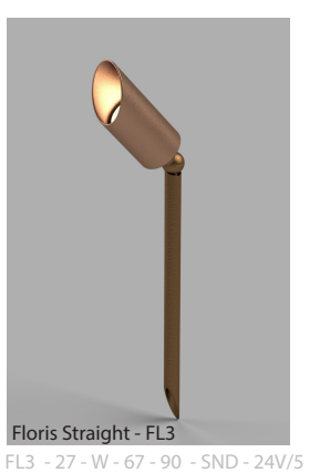
RAL* a variety of Powder coated, Electro Plated and Anodised finishes are available Please contact your Omni-Via sales representative for further details.