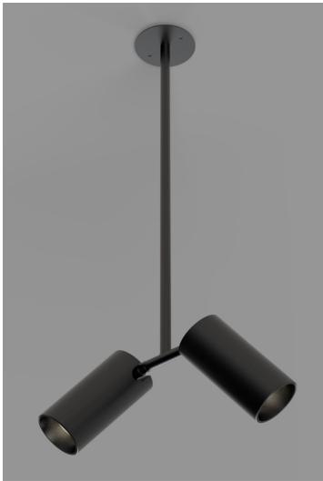
TubeSpot with Honeycomb Louvre

Available with filters, Glass Honeycomb louvres and slash nose tube perfect for finding the exact light and aesthetic required