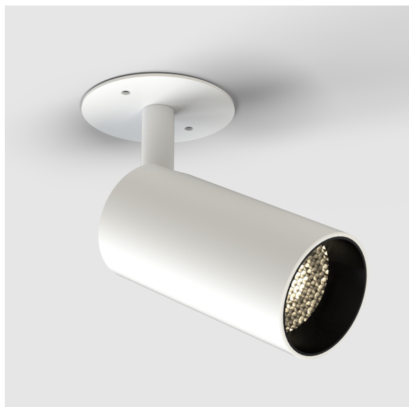
TubeSpot with Honeycomb Louvre

Available with filters, Glass Honeycomb louvres and slash nose tube perfect for finding the exact light and aesthetic required