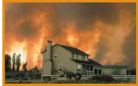
Figure 1: Firefighters will do their best to protect homes, but ultimately it is the homeowner's responsibility to plan ahead and take actions to reduce fire hazards around structures.

In this guide, you'll read about steps you can take to protect your property from wildfire. These steps focus on beginning work closest to your house and moving outward. Also, remember that keeping your home safe is not a one-time effort – it requires ongoing maintenance. It may be necessary to perform some actions, such as removing pine needles from gutters and mowing grasses and weeds several times a year, while other actions may only need to be addressed once a year. While