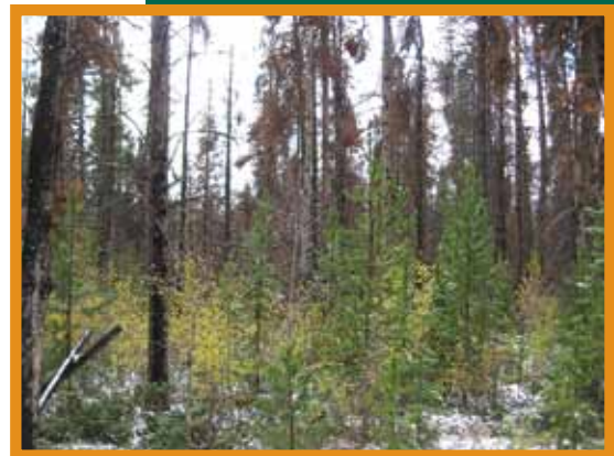
Figure 23: A young lodgepole pine stand. Thinning lodgepole pines early on in their lives will help reduce the wildfire hazard in the future.