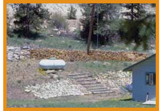
Figure 19: Keep firewood, propane tanks and natural gas meters at least 30 feet away from structures.