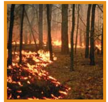
Figure 5: Surface fuels include logs, branches, wood chips, pine needles, duff and grasses.