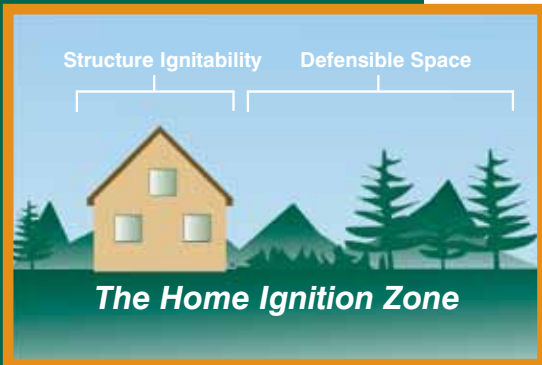
Figure 7: Addressing both components of the Home Ignition Zone will provide the best protection for your home.

Two factors have emerged as the primary determinants of a home's ability to survive a wildfire – the quality of the defensible space and a structure's ignitability. Together, these two factors create a concept called the Home Ignition Zone (HIZ) , which includes the structure and the space immediately surrounding the structure. To protect a home from wildfire, the primary goal is to reduce or eliminate fuels and ignition sources within the HIZ.