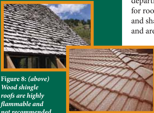
Figure 8: (above) Wood shingle roofs are highly flammable and not recommended.

This guide provides only basic information about structural ignitability. For more information on fire-resistant building designs and materials, refer to the CSFS FireWise Construction: Site Design and Building Materials publication at www.csfs.colostate.edu .