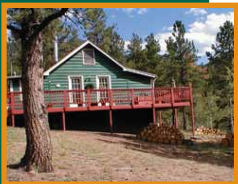
Figure 10: Decks, exterior walls and windows are important areas to examine when addressing structure ignitability.