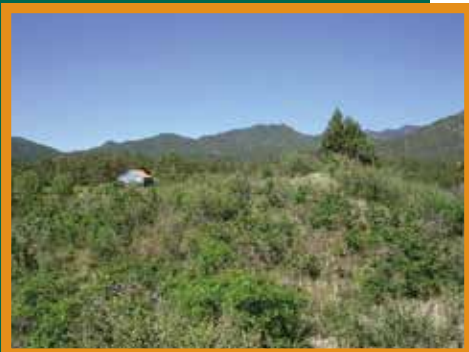
Figure 25: Gambel oak needs to be treated in a defensible space at least every 5-7 years because of its vigorous growing habits.