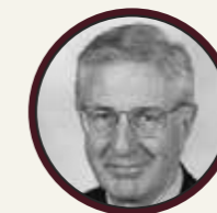
Vice-Chair Lord Richard Layard