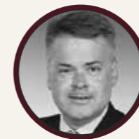
Co-Chair Tim Loughton MP