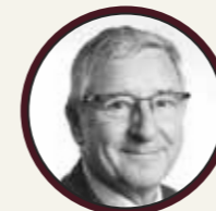
Vice-Chair Jim Fitzpatrick MP