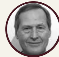
Secretary Lord Alan Howarth