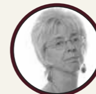
Vice-Chair Baroness Ruth Lister