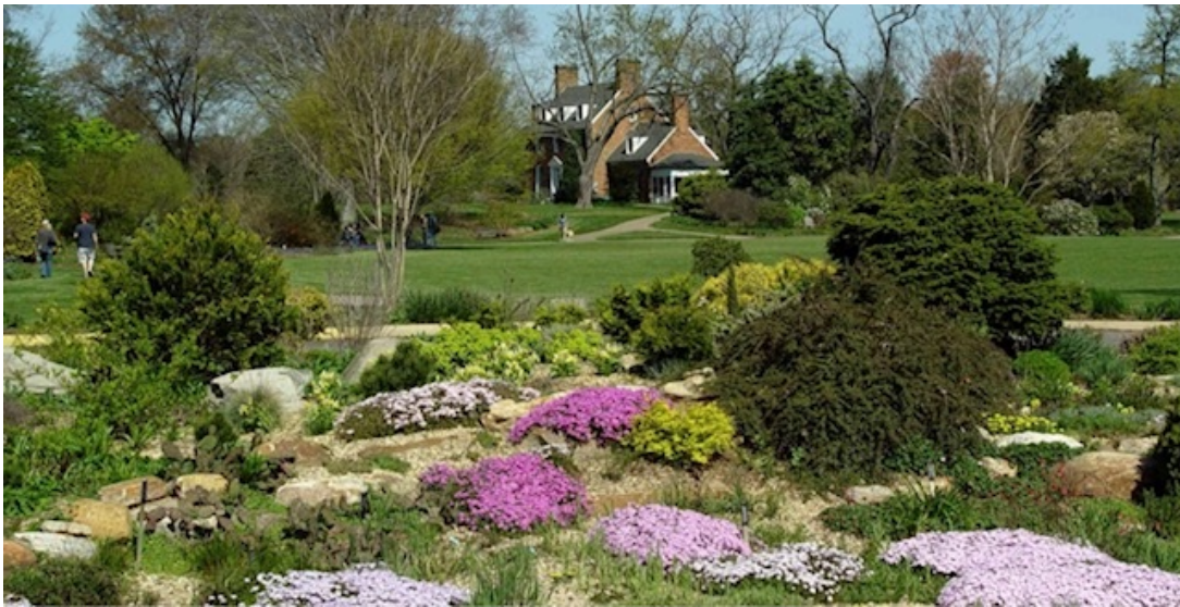
Green Spring Gardens Park (click on photo for more information)