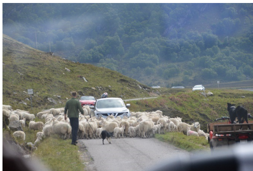
Rush Hour in Scotland