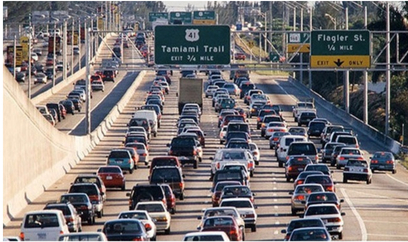
"The horse is here to stay but the automobile is only a novelty - a fad." The President of Michigan Savings Bank declining to invest in the Ford Motor Co., 1903