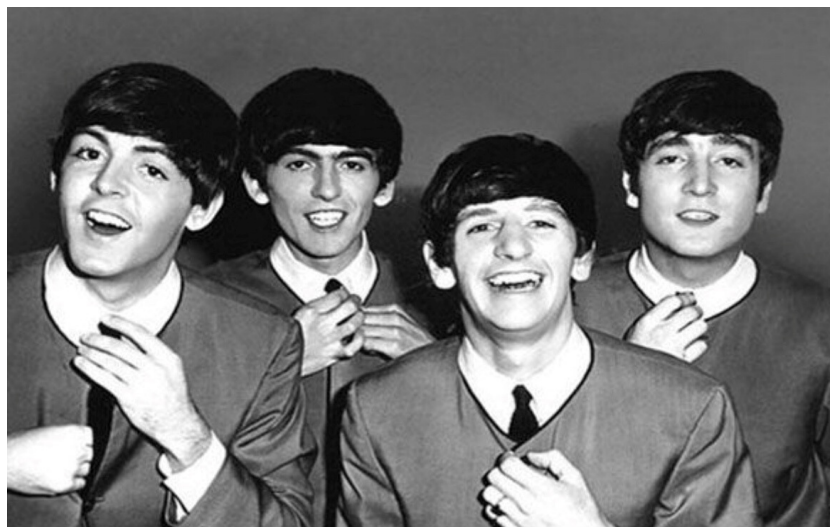
"We don't like their sound, and guitar music is on the way out." Decca Records on declining to sign the Beatles, 1962.