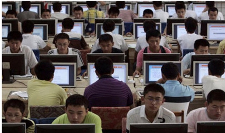
"I think there is a world market for maybe Five computers" - - Thomas Watson, Chairman of IBM, in 1943