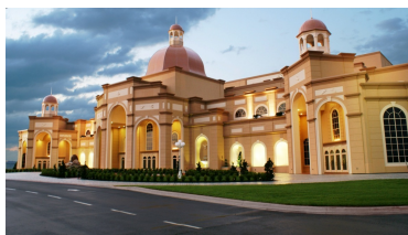
Sight and Sound Theatre