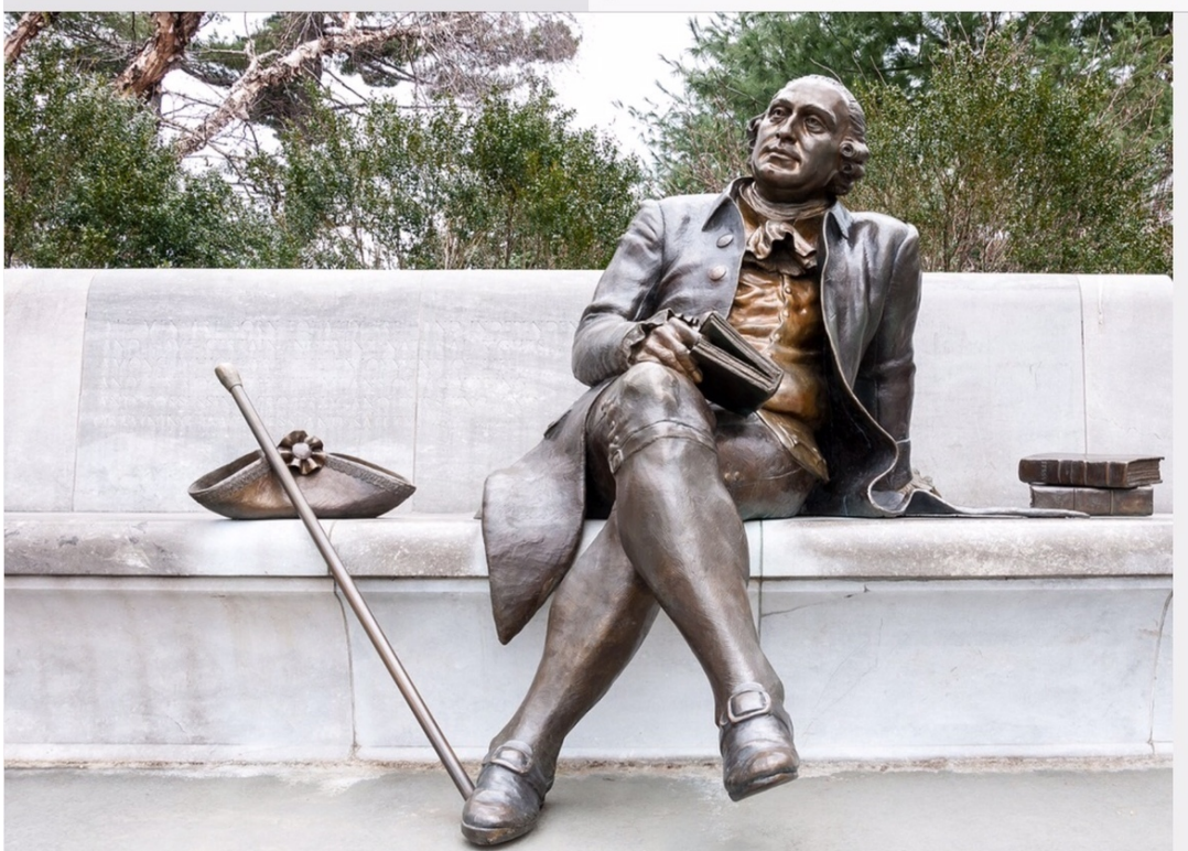
Statue of George Mason at the George Mason Memorial in Washington DC (click on image for more information)