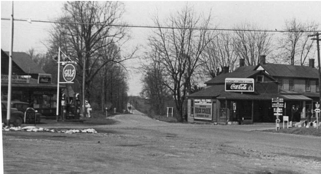
Tysons Corner, 1936. For more information click on image.