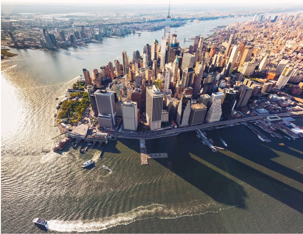
More people live in New York City than in 40 of the 50 states.