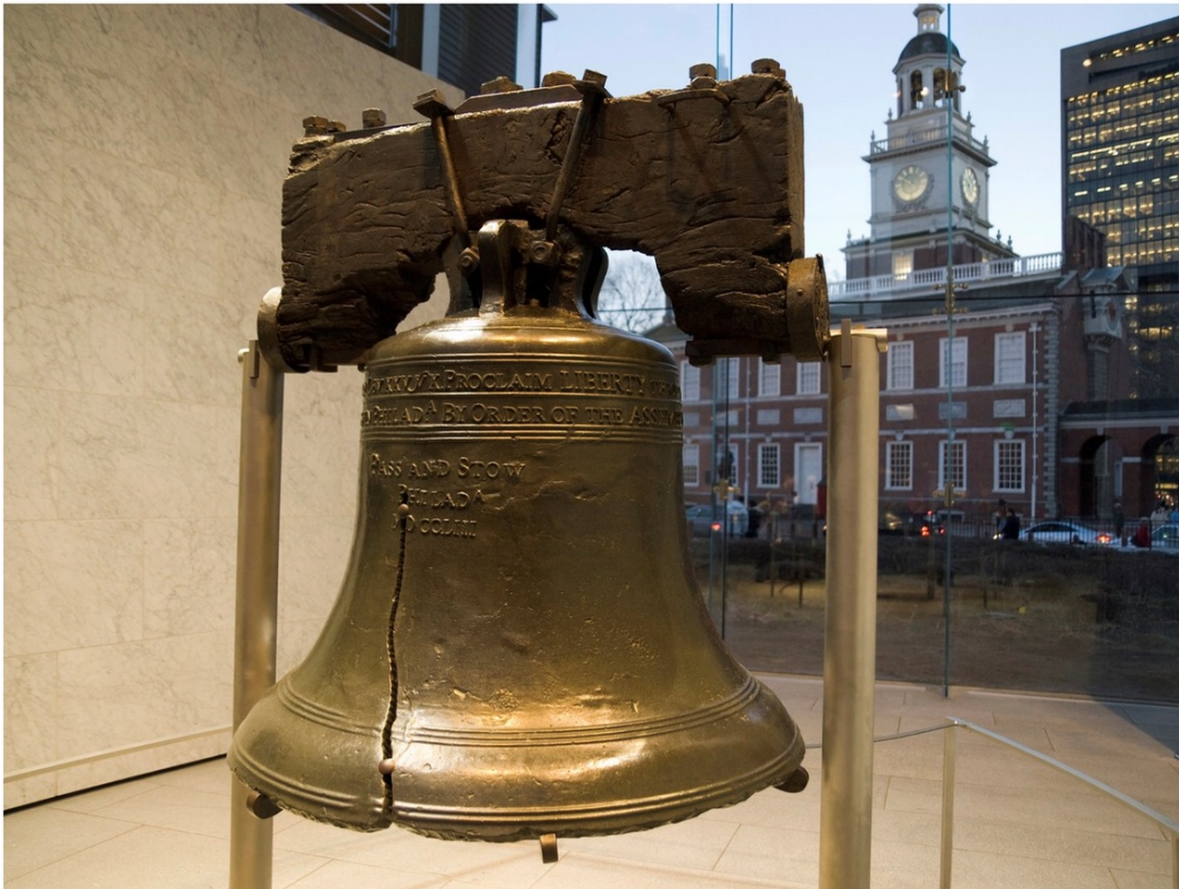
The word "Pennsylvania" is misspelled on the Liberty Bell.