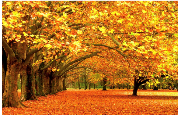
Fall Foliage in Virginia