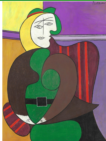
The Red Armchair, Pablo Picasso, 1931

The fact that Cubism is not understood and that there are people who cannot see anything in it means nothing. I do not read English; an English book is a blank book to me. This does not mean that the English language does not exist. Why should I blame anyone but myself if I cannot understand what I know nothing about? — Pablo Picasso