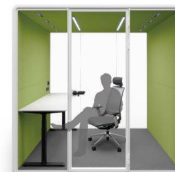
Ergonomic office chair + Electrical adjustable desk