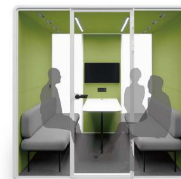
163 couch x 2 + Back pillar + WM 125 meeting table