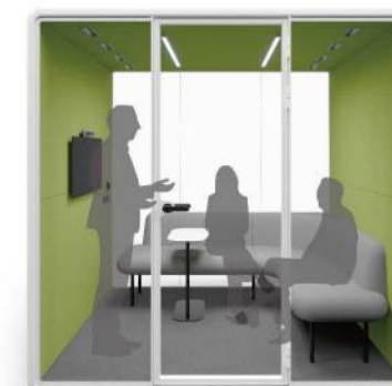
200 L-shape couch + C-table