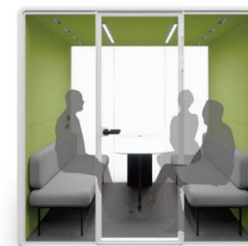
163 couch x 2 + 125 meeting table