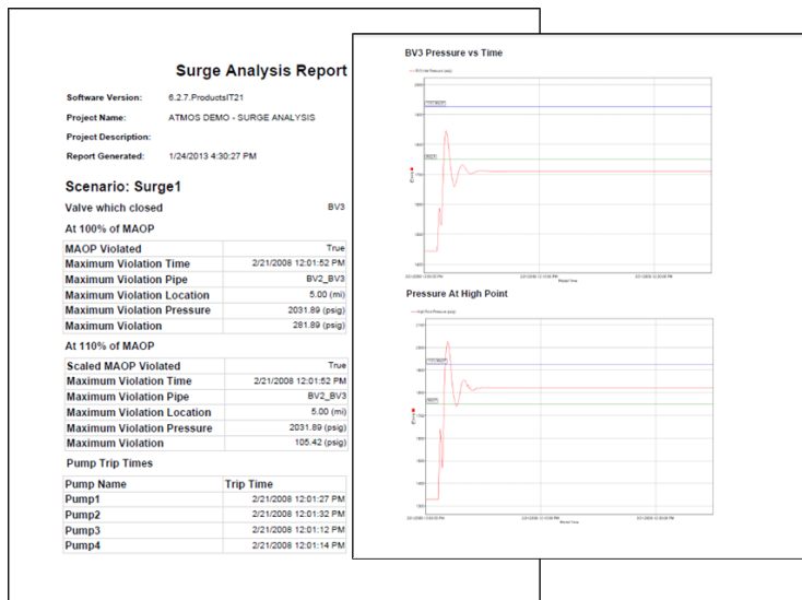
Surge analysis report

Atmos International Email: info@atmosi.com