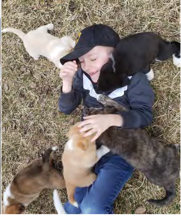
ADHS thanks its many supporters. We rely on your donations to operate. See page 7 for how you can help.