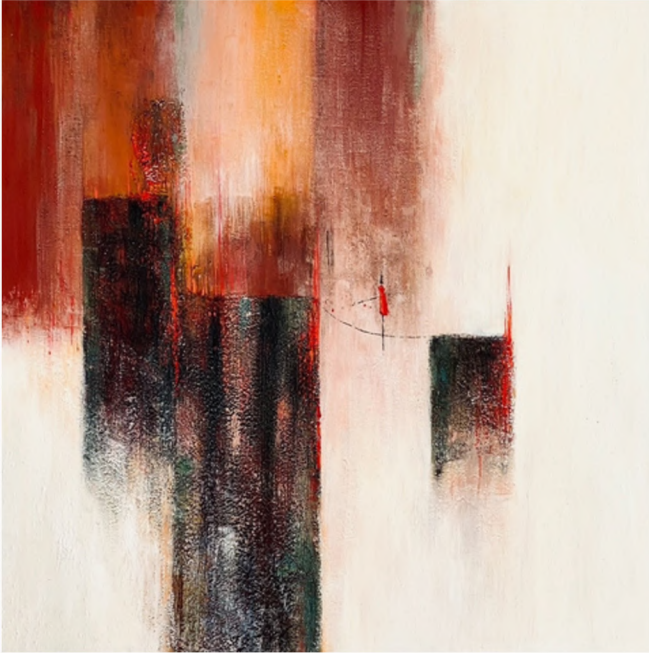
My Brave Way II 2026 40 x 40 cm Acrylic on Alu-Dibond