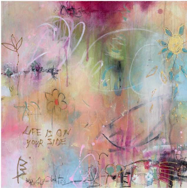
Life Is On Your Side 2026 60 x 60 cm Mixed media on canvas