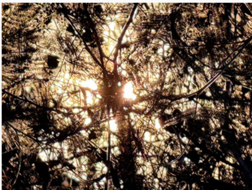
Mimosa 2026 40 x 50 cm Hahnemühle German Etching 310 gsm Oak frame/UV Protected Edition 1 of 3