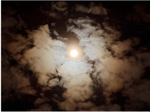
The Moon 2026 40 x 50 cm Hahnemühle German Etching 310 gsm Oak frame/UV Protected Edition 1 of 3