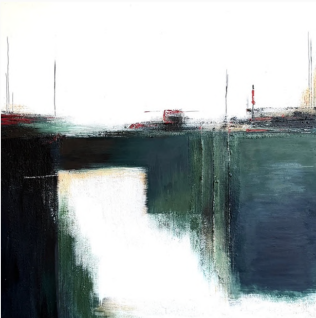
My Brave Way III 2026 40 x 40 cm Acrylic on Alu-Dibond