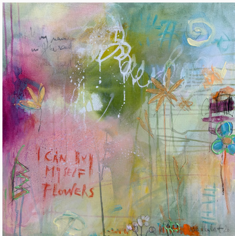
I Can Buy Myself Flowers 2026 60 x 60 cm Mixed media on canvas