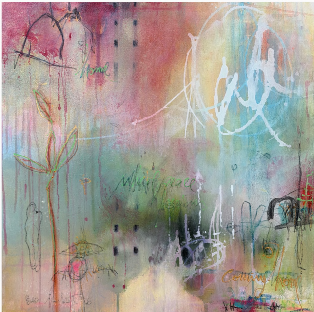
Home, Where Peace Begins 2026 60 x 60 cm Mixed media on canvas