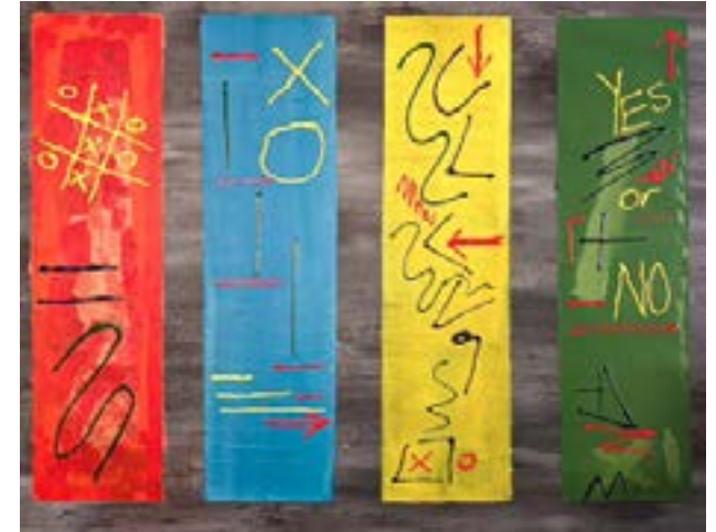
1/3: "Our freedoms won't enslave us" . Acrylic . 2023 . 24 x 30" .

Whether stenciling, splashing, crafting, brushing, spraying, pouring, tracing or working behind a screen, this Mixed-media artist is drawn to unusual experiences & celebrating creative community. His creative agenda is to inspire spaces, nudge reflection, connect cultures and bring joy! Nigerian born, London based, TV loving, Music mad, socially conscious and constantly on the lookout for new ways to support other creatives, create & enjoy more art!