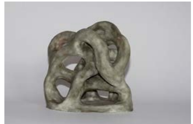
Tangled III Clay, glaze H21xW23xD17 cm