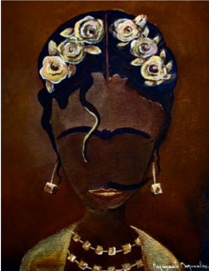
Keep on Shining Paintings, 30 W x 40H