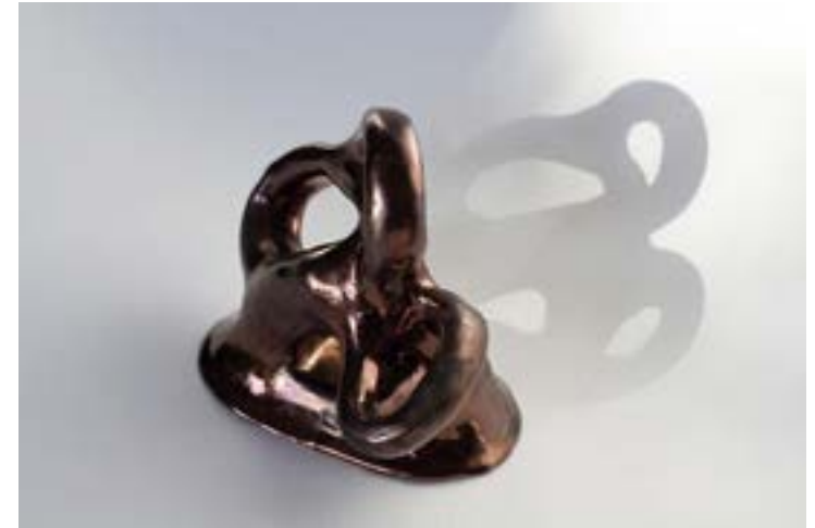
Tangled II Clay, glaze

The Tangled series, like a heartbeat monitor, reflects our ever-changing inner world tied to the subconscious. Overlapping limbs signify progress against anxiety and past burdens, while negative space hints at uncharted territory, promising cosmic wonder and endless possibilities.