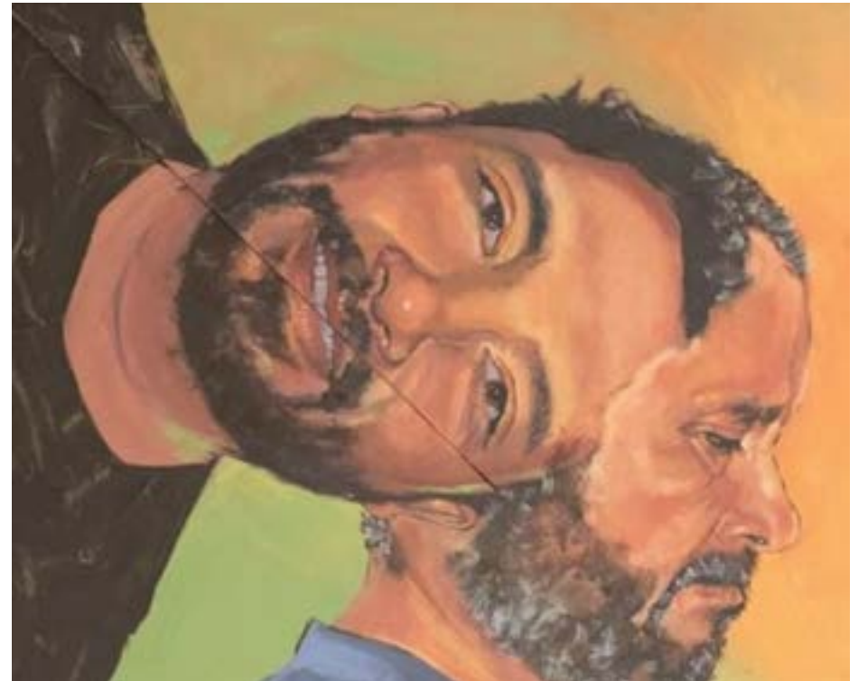
Generational Identities 2023 Print 42cm X 59.4cm