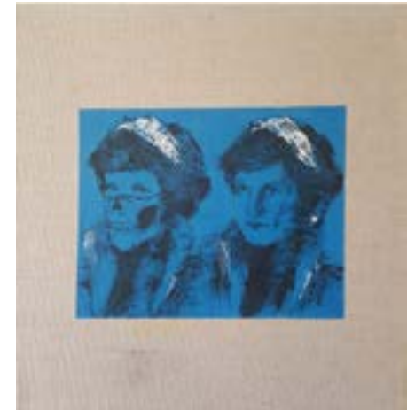
“The people 's Queen “ Size 30x30cm Oil on Linen Canvas Y.2021