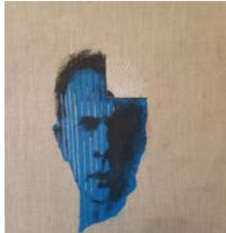
“Book Ring “ Size 30x30 cm Oil on Linen canvas Y.2021