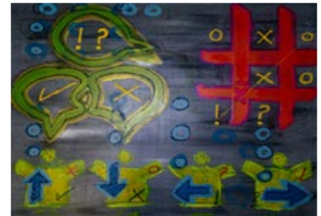
2/3: "Because popular opinions change..." . Acrylic. 2023. 24 x 30"