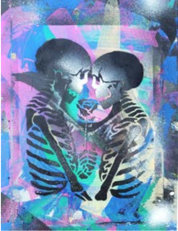
“The fourth” Paintings, 30 x 40 cm, 2023