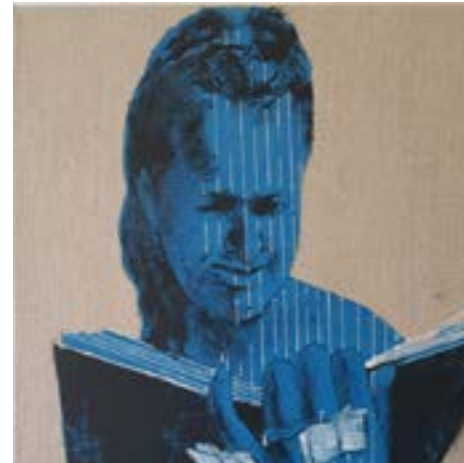
“Me and my Book” Size 30x30 Oil on Linencavas Y.2021