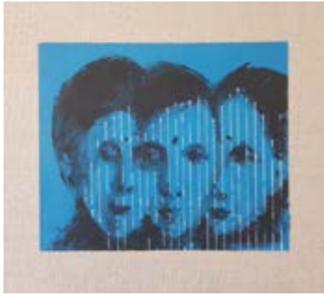
“Three Sister “ Size 30x30cm Oil on Linen Canvas Y.2021