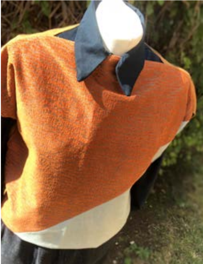
“LucianaSoul” Recycling garment, 2023