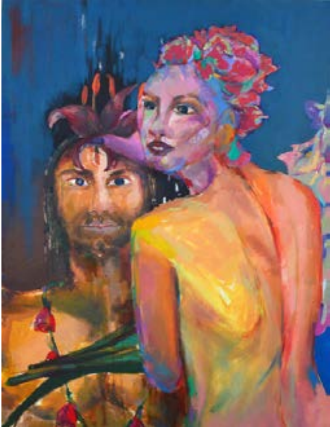
Title: A Loving Gesture Medium (Painting): Oil paint on canvas Size: 30" x 48"