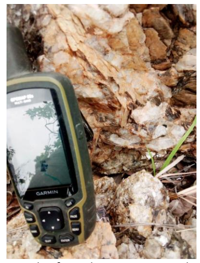
Figure 3: Photograph of Spodumene in Weathered Pegmatite

The Company will mobilise an exploration team early in the New Year to better understand the extent of pegmatites and associated spodumene and lithium mineralisation.