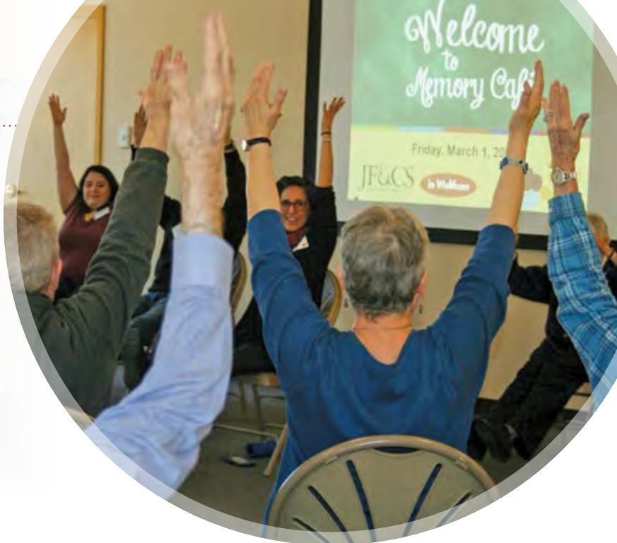
top, background: Dementia Friends trains volunteer “Champions” who offer information sessions in their communities; top: JF&CS’s Memory Cafe offers social gatherings for people with Alzheimer’s and related disorders and their care partners; bottom: Dementia Friends workshop participants.

At some point in our lives, we’ll all be confronted with making decisions on behalf of people we love who are getting older and need more care. Knowing where to find help and resources can make a significant difference in how we manage the challenges. WW