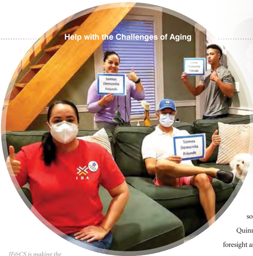
JF&CS is making the international awareness program Dementia Friends available in Massachusetts.