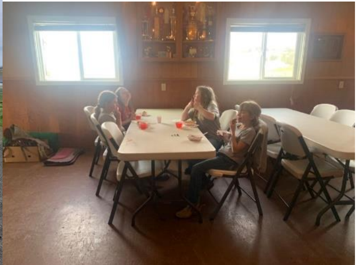
You can't tell by the pictures but