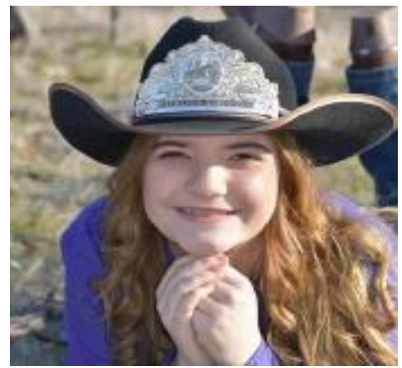
49er's Saddle Club 2022 Royalty Court