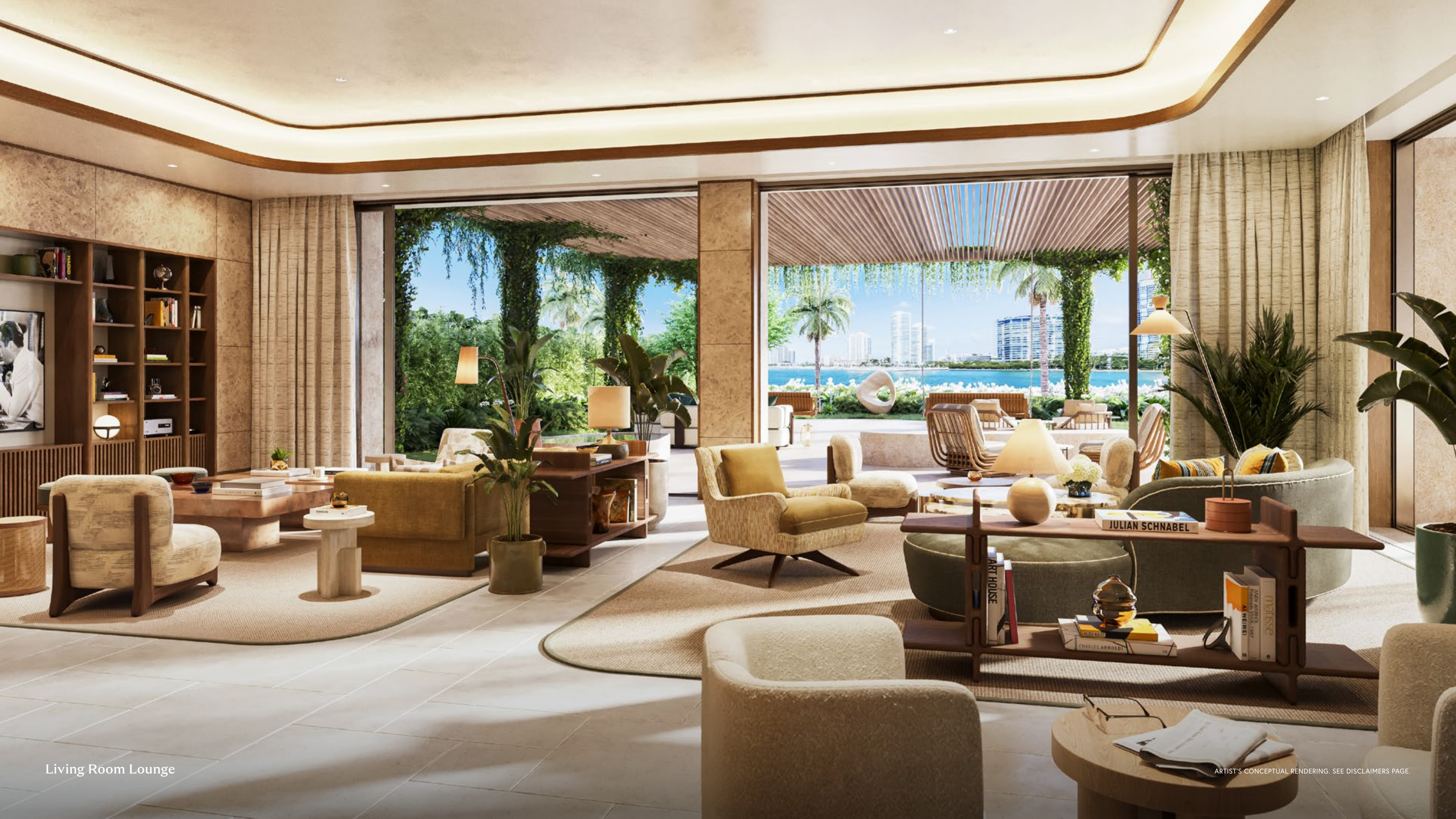
Living Room Lounge

ARTIST'S CONCEPTUAL RENDERING. SEE DISCLAIMERS PAGE.