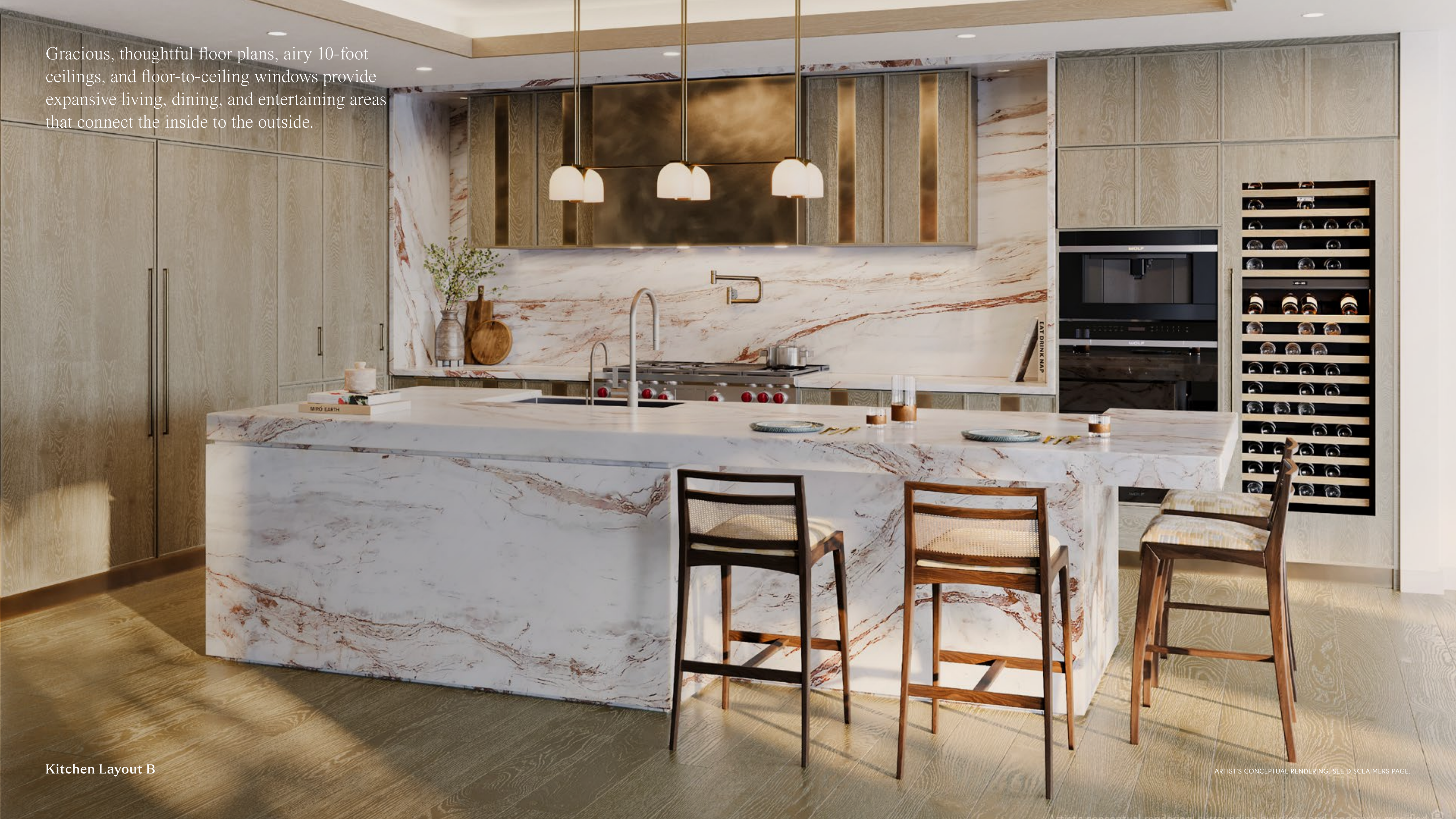
Kitchen Layout B

Gracious, thoughtful floor plans, airy 10-foot ceilings, and floor-to-ceiling windows provide expansive living, dining, and entertaining areas that connect the inside to the outside.