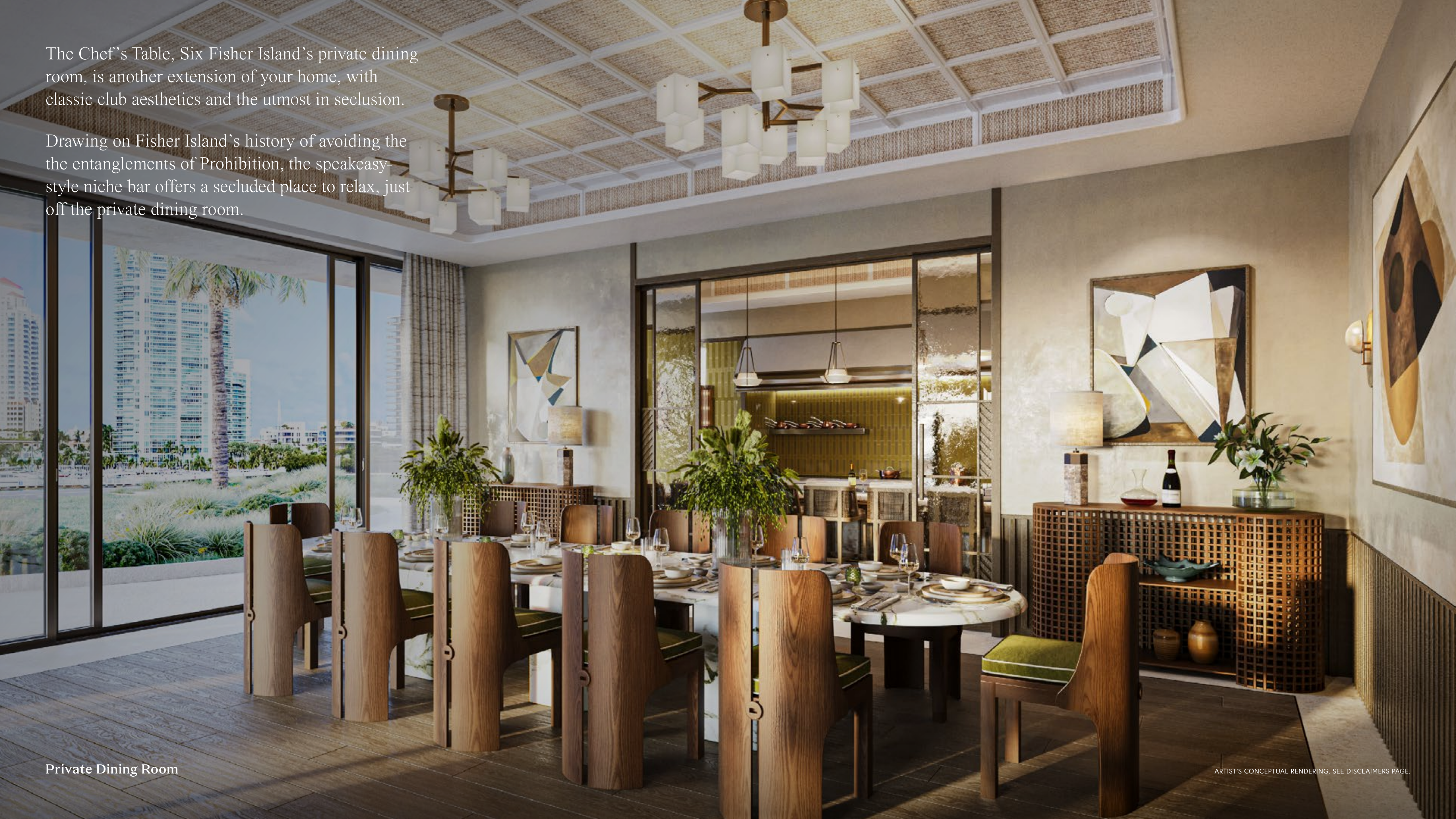
Private Dining Room

Drawing on Fisher Island's history of avoiding the the entanglements of Prohibition, the speakeasy-style niche bar offers a secluded place to relax, just off the private dining room.