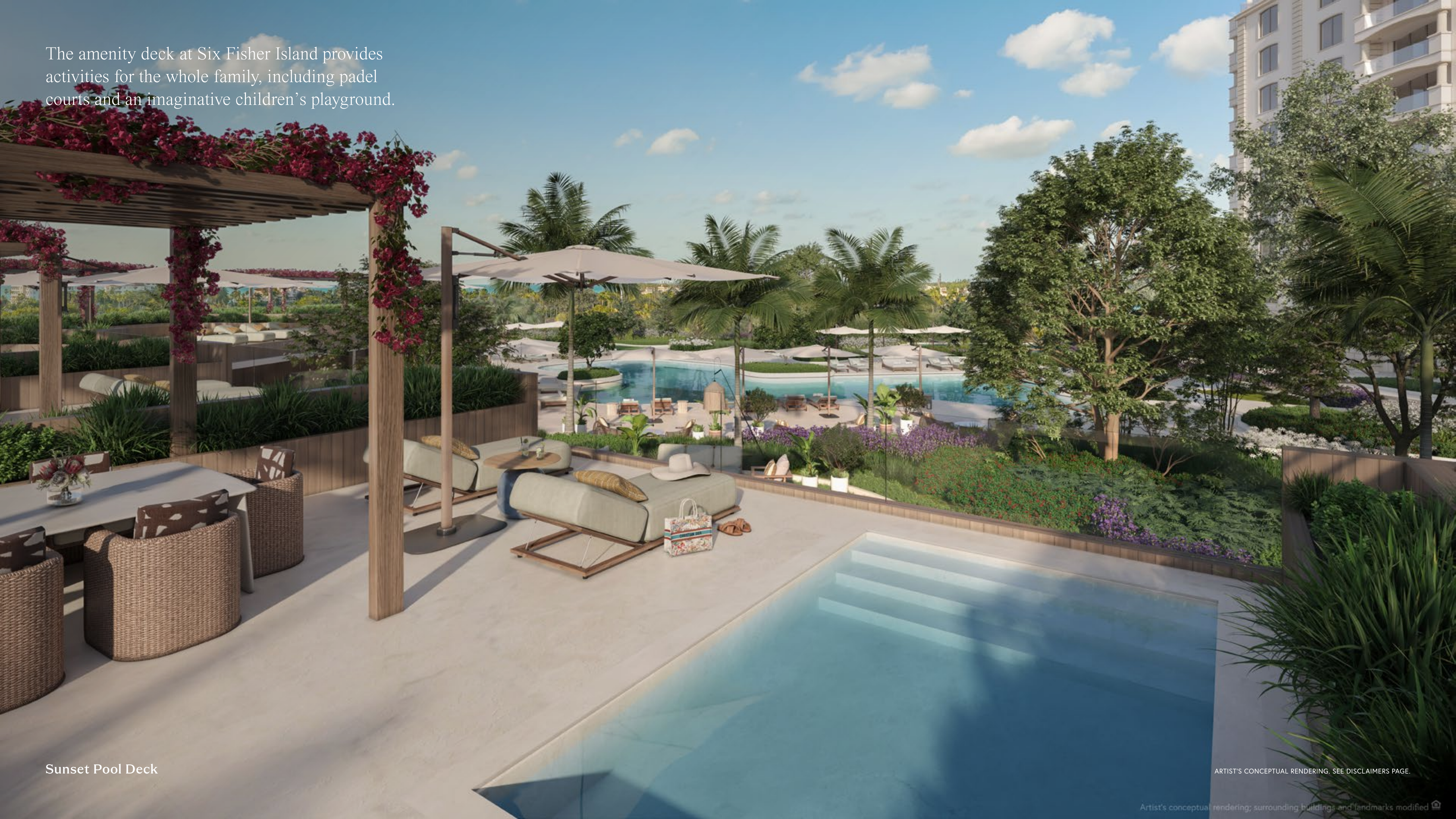
Sunset Pool Deck

The amenity deck at Six Fisher Island provides activities for the whole family, including padel courts and an imaginative children's playground.