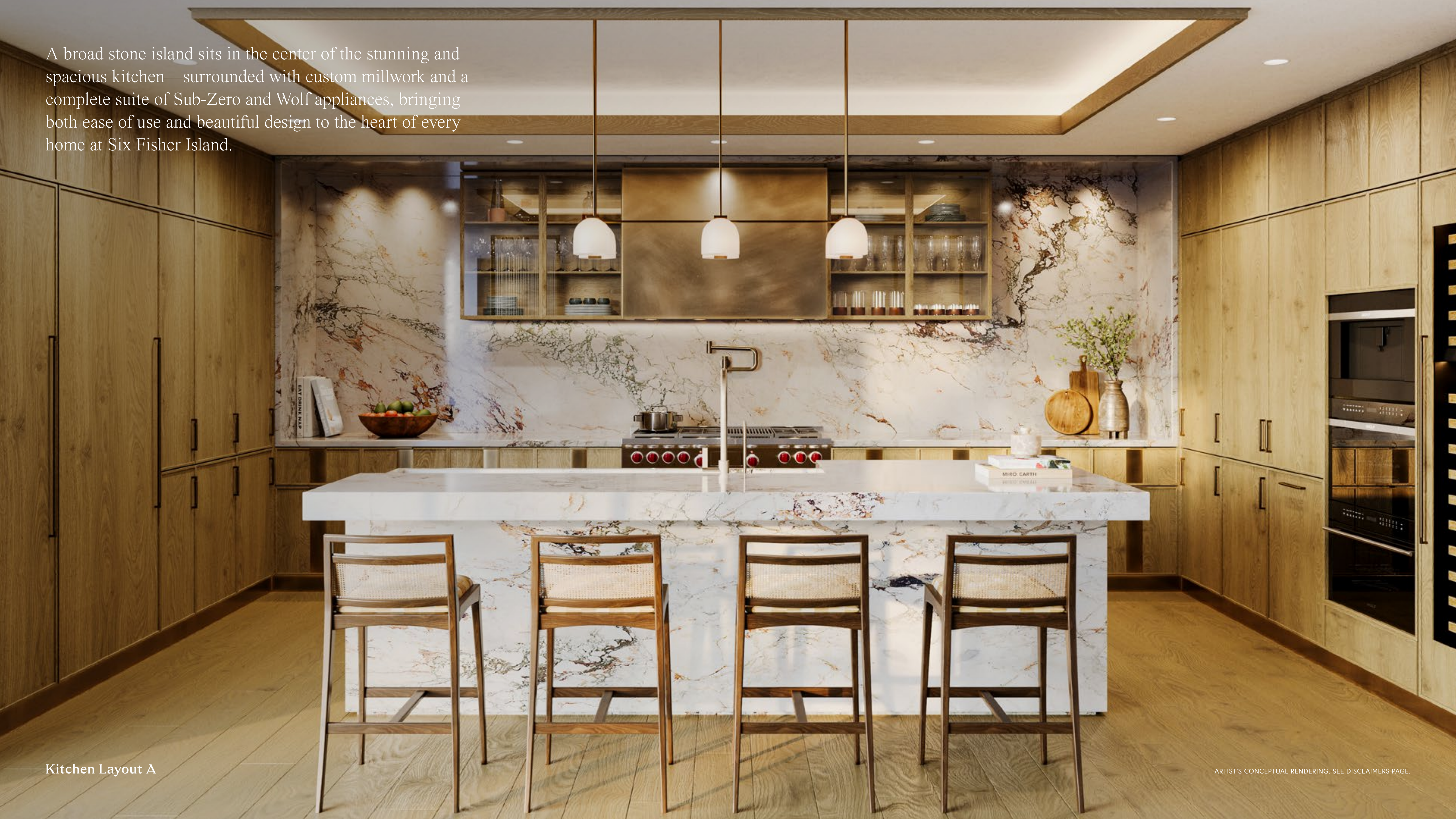
Kitchen Layout A

A broad stone island sits in the center of the stunning and spacious kitchen—surrounded with custom millwork and a complete suite of Sub-Zero and Wolf appliances, bringing both ease of use and beautiful design to the heart of every home at Six Fisher Island.