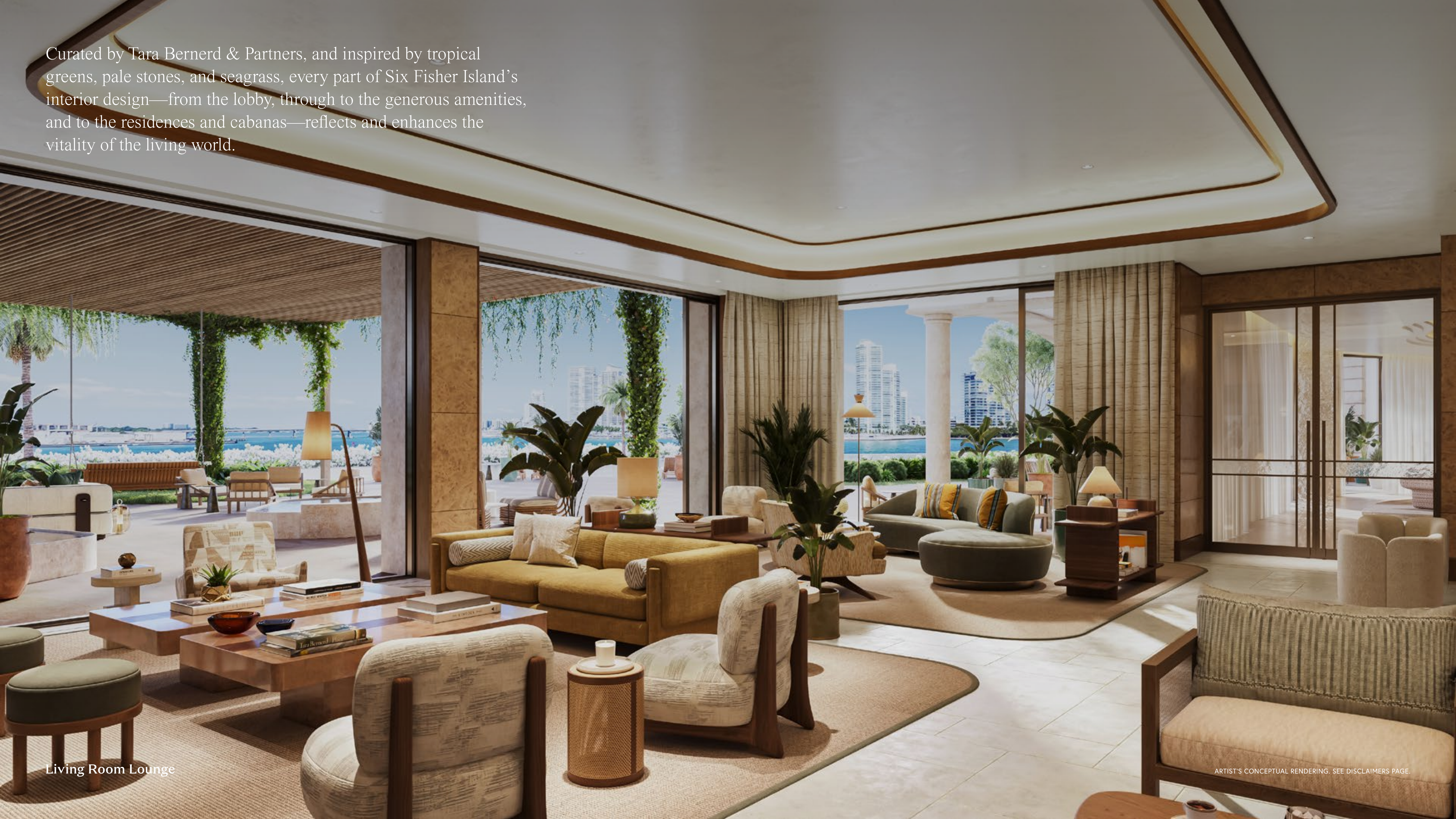
Living Room Lounge

Curated by Tara Bernerd & Partners, and inspired by tropical greens, pale stones, and seagrass, every part of Six Fisher Island's interior design—from the lobby, through to the generous amenities, and to the residences and cabanas—reflects and enhances the vitality of the living world.