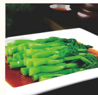
蒜蓉炒時菜 Stir Fried Seasonal Vegetable with Garlic Sauce