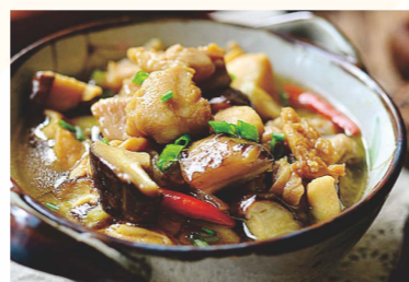
冬菇蒸滑雞 Steamed Chicken Pieces with Chinese Mushroom