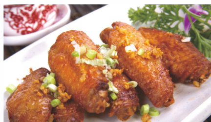
蒜香雞翼 Chicken Wings in Dried Garlic