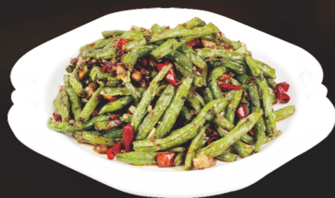
干扁四季豆 Green Bean with Pork Minces