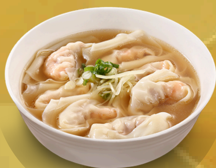
SP 雲吞湯 Wonton Soup