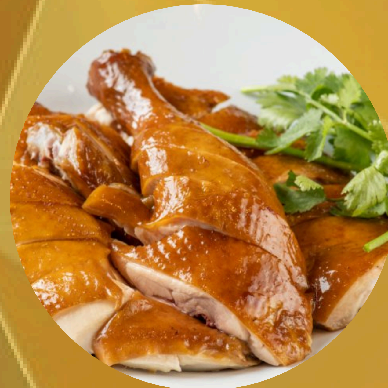
如意豉油雞脾 Soy Maryland