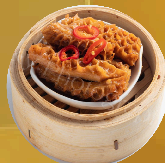
D 沙嗲牛肚 Braised Beef Tripe, Satay Sauce