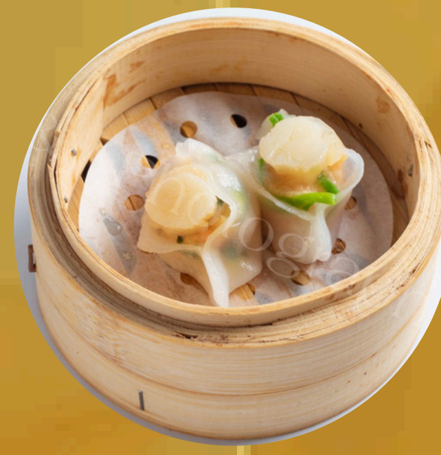
A 鳳眼帶子餃 Steamed Scallop & Prawn Dumplings (2pcs)