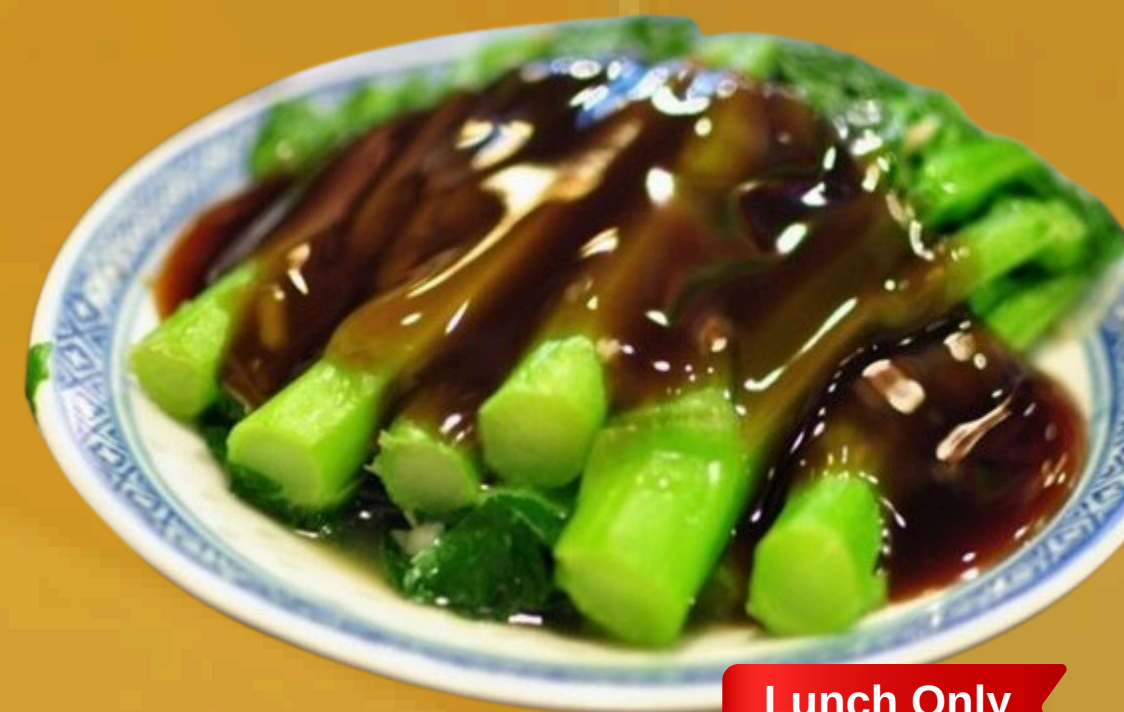
SP 蠔油時菜 Asian Green with Oyster Sauce