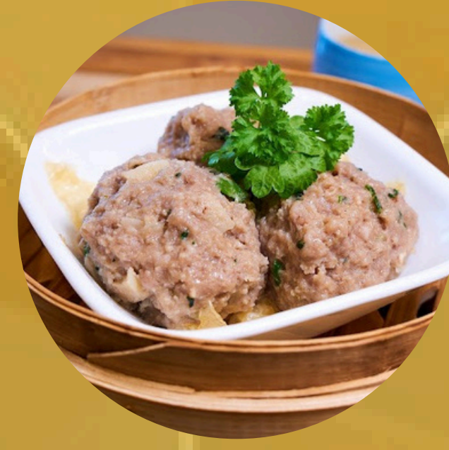
D 山竹牛肉球 Beef Mince Ball