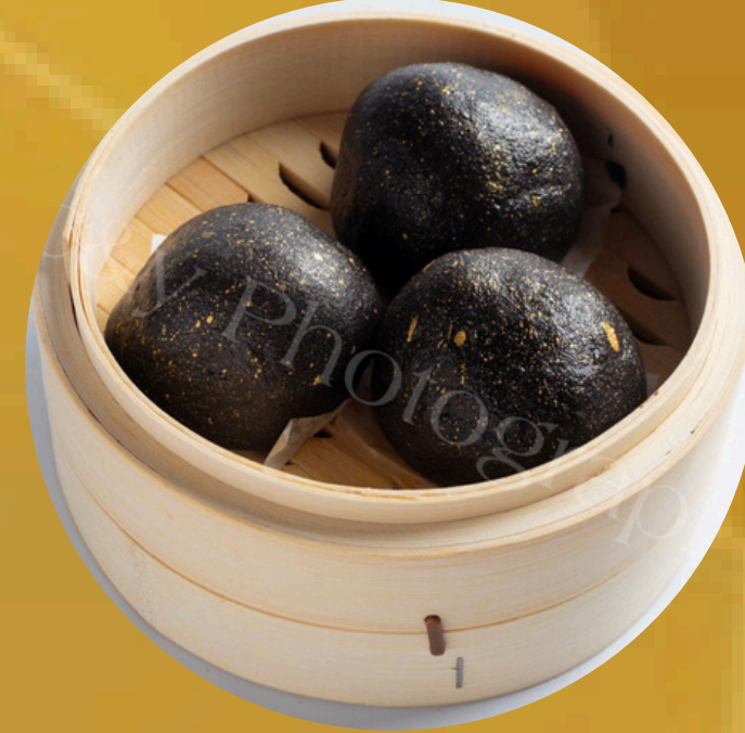
B 黑金奶皇包 Steamed Classic Custard Buns (3pcs)