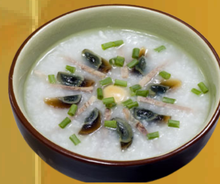
皮蛋瘦肉粥 SP Congee with Pork & Century Egg