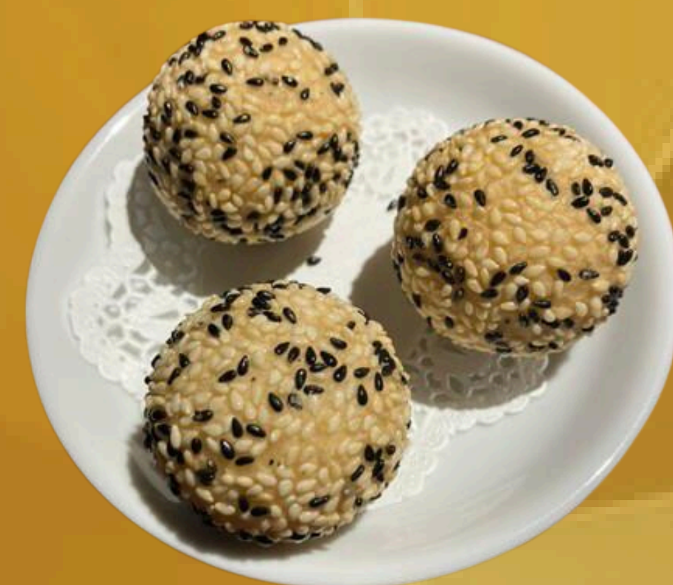
B 豆沙煎堆 Sesame Ball w/ Red Bean Paste