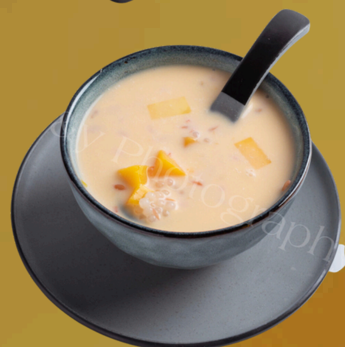
C 楊枝甘露 Mango Pomelo Sago