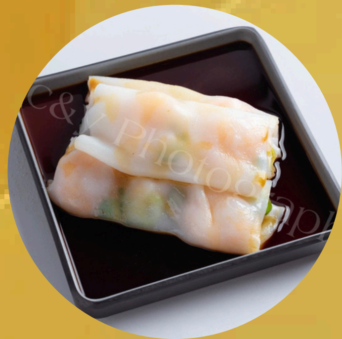
鮮蝦腸粉 SP Steamed Prawn Rice Noodle Roll