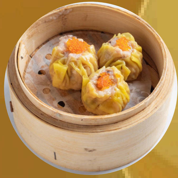
D 經曲燒賣 Pork & Shrimp Siu Mai (3pcs)