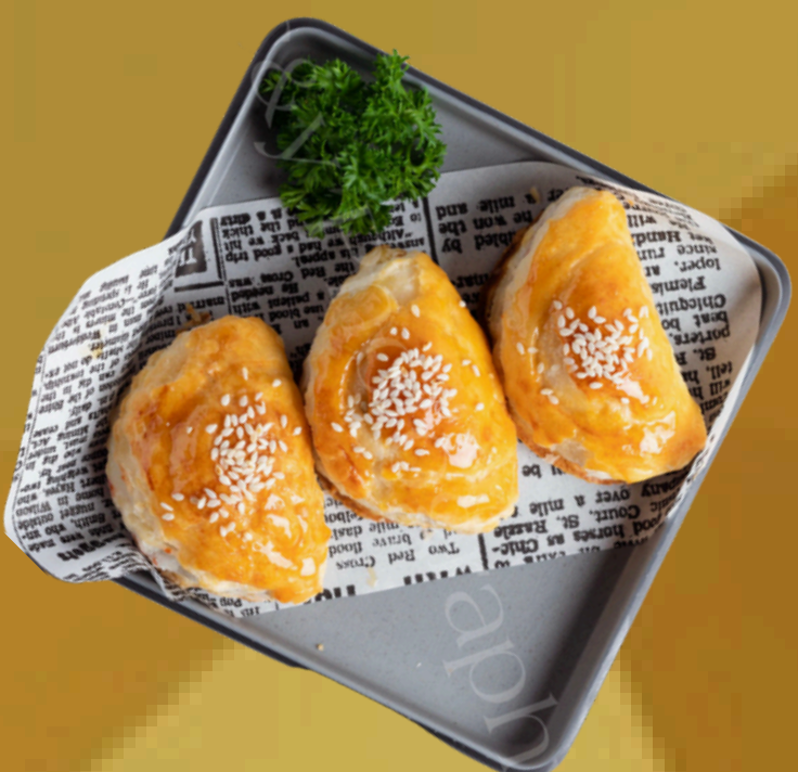
叉燒酥 D BBQ Pork Pastries (3)