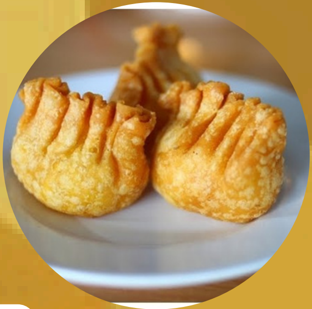
D 沙律蝦角 Deep Fried Prawn Dumpling (3pcs)