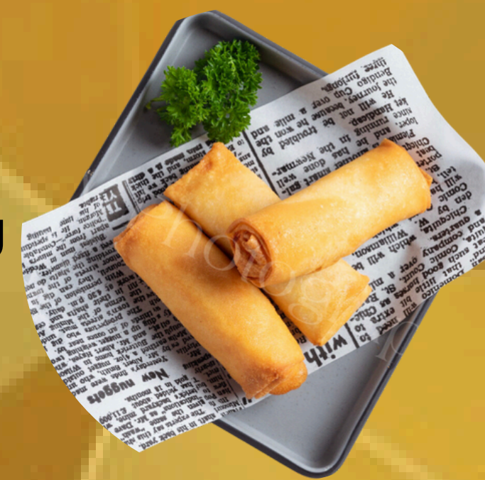
豬肉春卷 C Pork Spring Rolls (3)