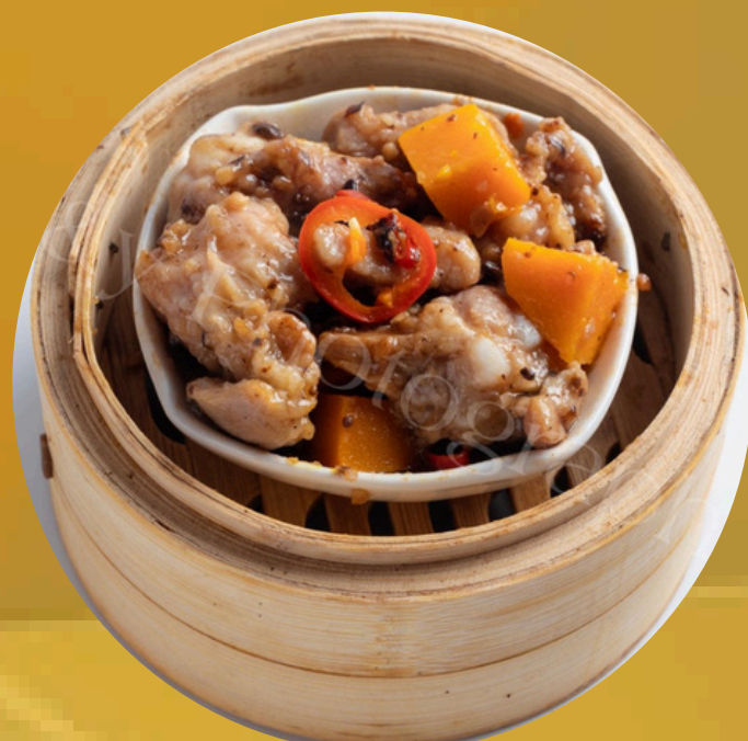
D 豉汁南瓜蒸排骨 Steamed Pork Ribs, Pumpkin, Black Bean Sauce