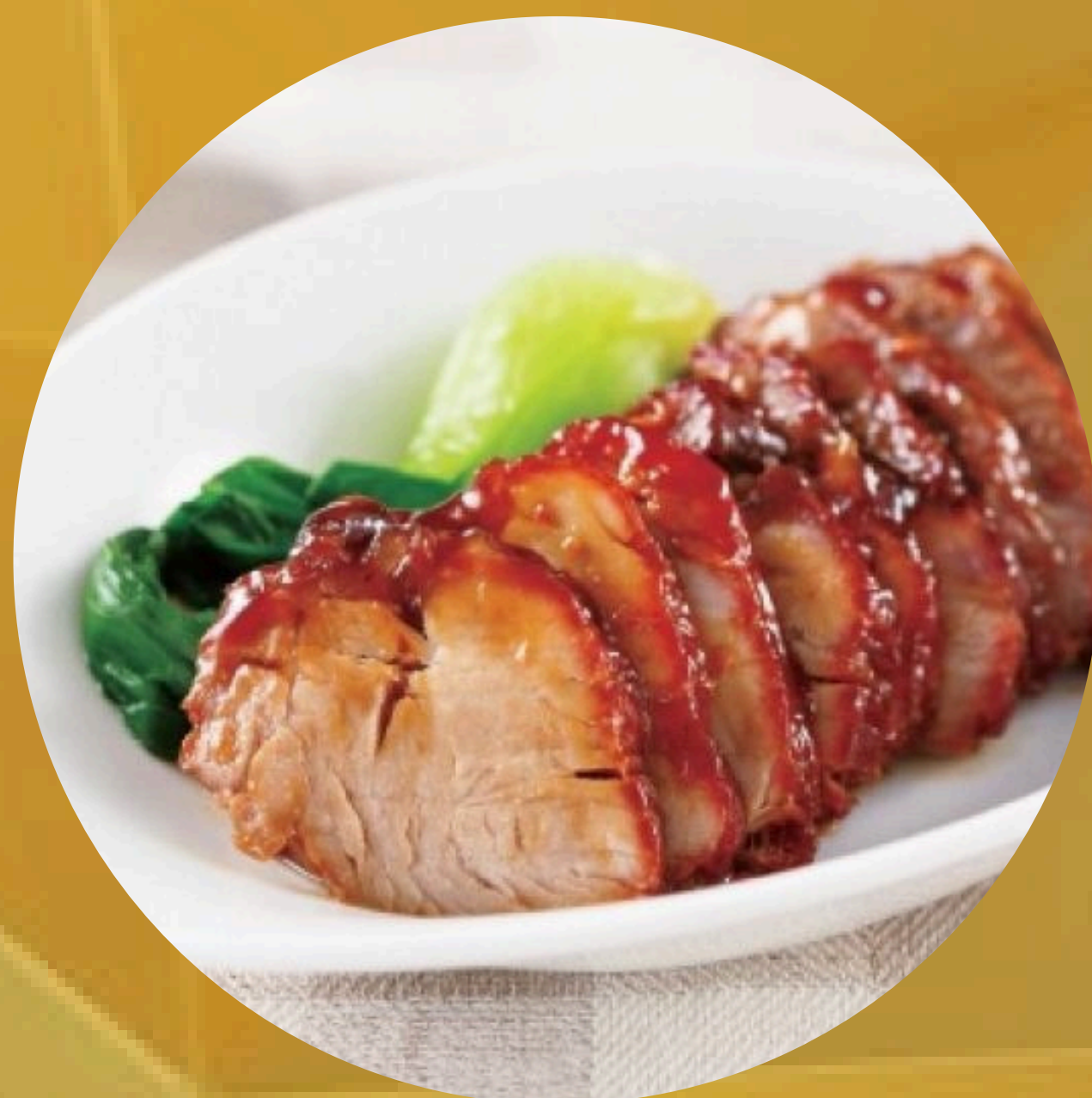
蜜汁叉燒 BBQ Pork