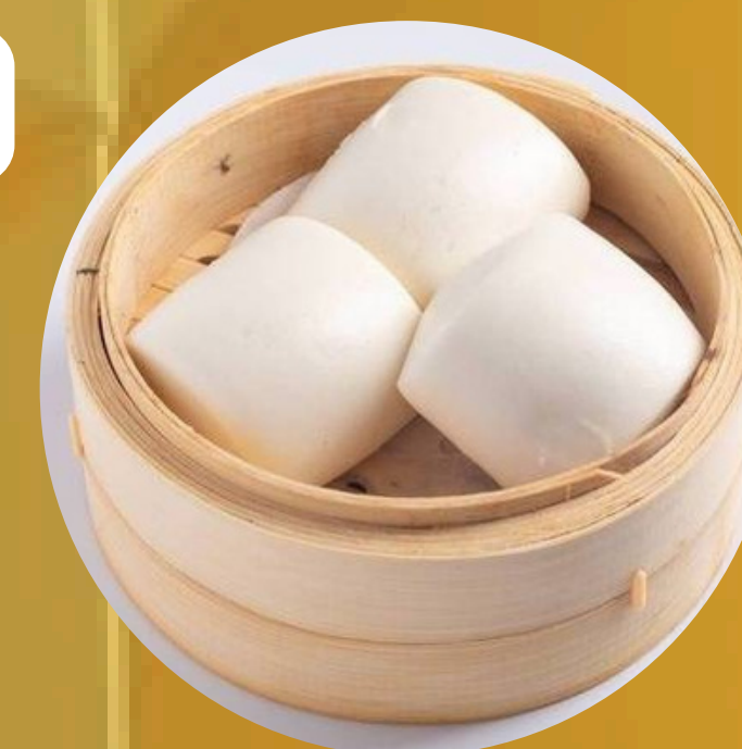
B 蒸饅頭 Steamed Plain Buns (3pcs)