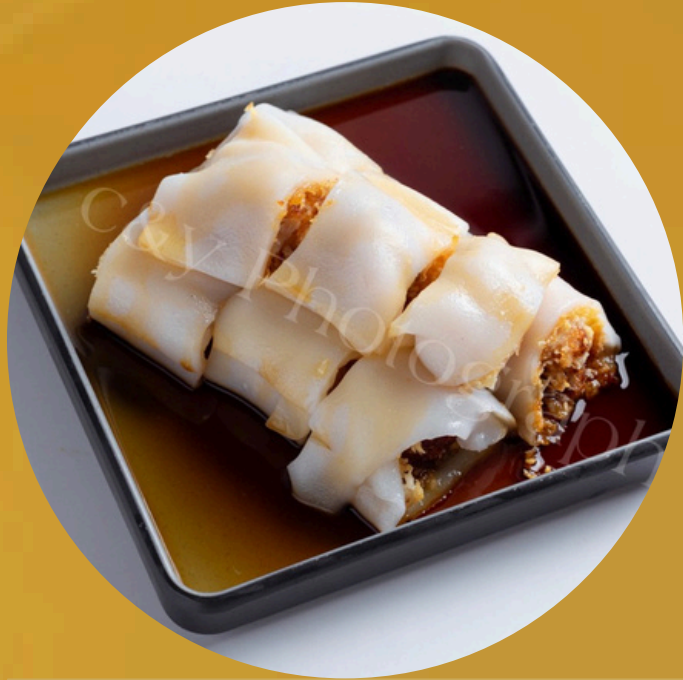
大排檔炸兩 SP Steamed Rice Noodle Roll with Crispy Dough Stick