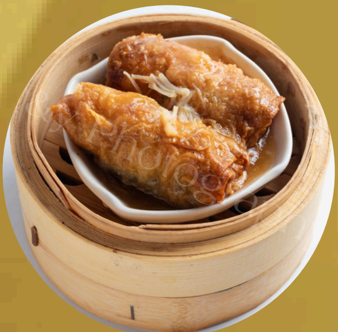
D 瑤柱鮮竹卷 Steamed Beancurd Rolls, Pork, Shrimp, Scallop (2pcs)