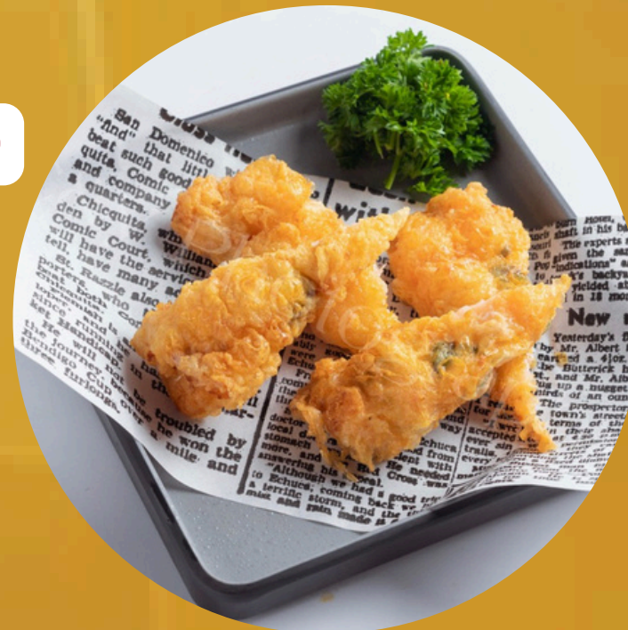
鮮蝦腐皮卷 D Deep Fried Prawn with Beancurd Skin Rolls (3)