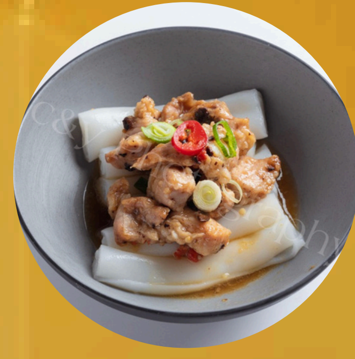
排骨撈腸粉 SP Steamed Rice Noodle Roll with Pork Ribs