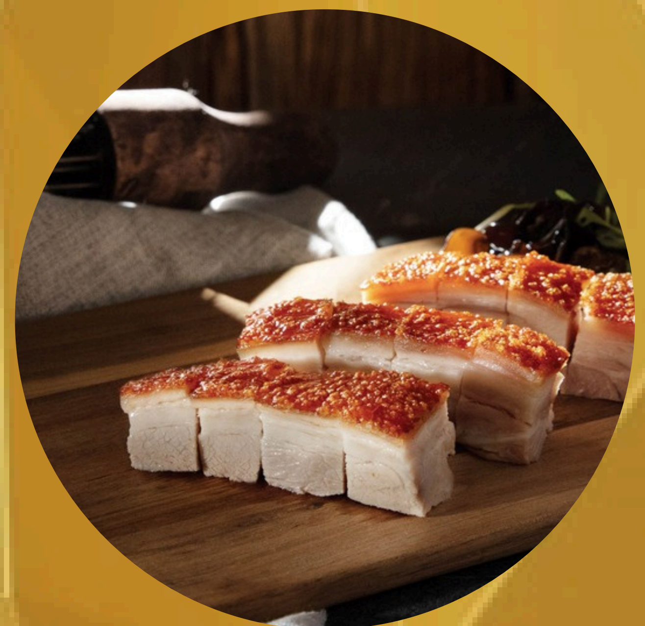
脆皮燒肉 Crispy Roasted Pork