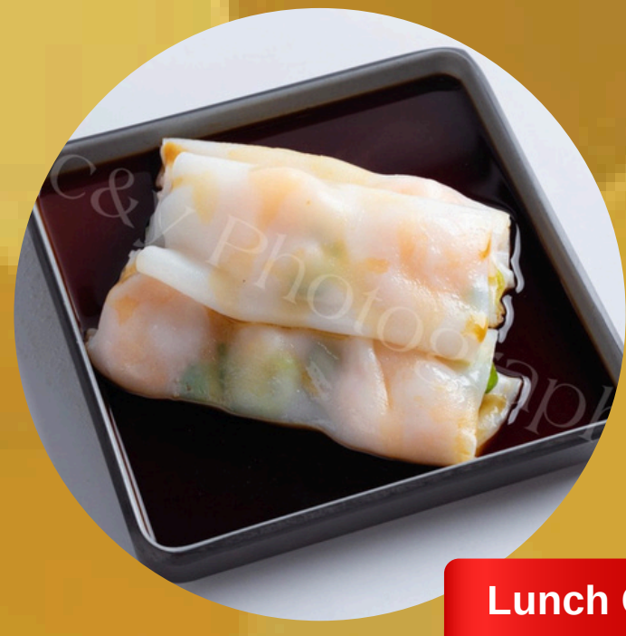
帶子腸粉 SP Steamed Scallop Rice Noodle Roll