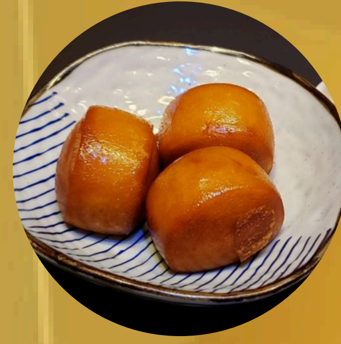
C 炸饅頭 Deep Fried Plain Buns (3pcs)