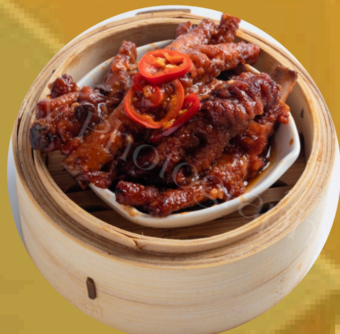
D 醬爆鳳爪 Steamed Chicken Feet, Signature Sauce