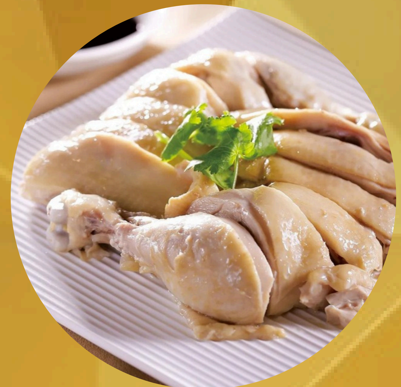
如意貴妃雞脾 Imperial Poached Maryland