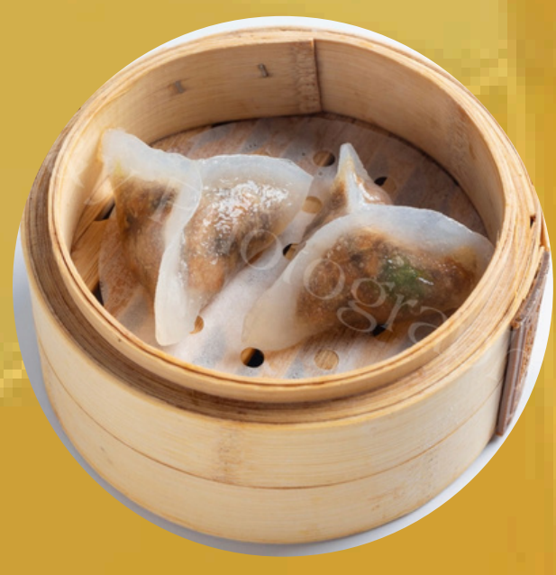
A 野菌餃 Assorted Mushroom Dumplings (2pcs)