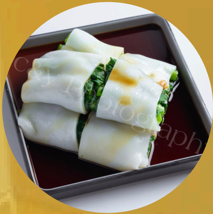
蔬菜腸粉 SP Steamed Rice Noodle Roll with Vegetable