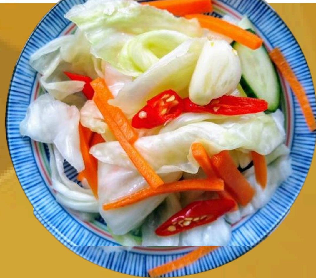
SP 三色泡菜 Sour Pickle