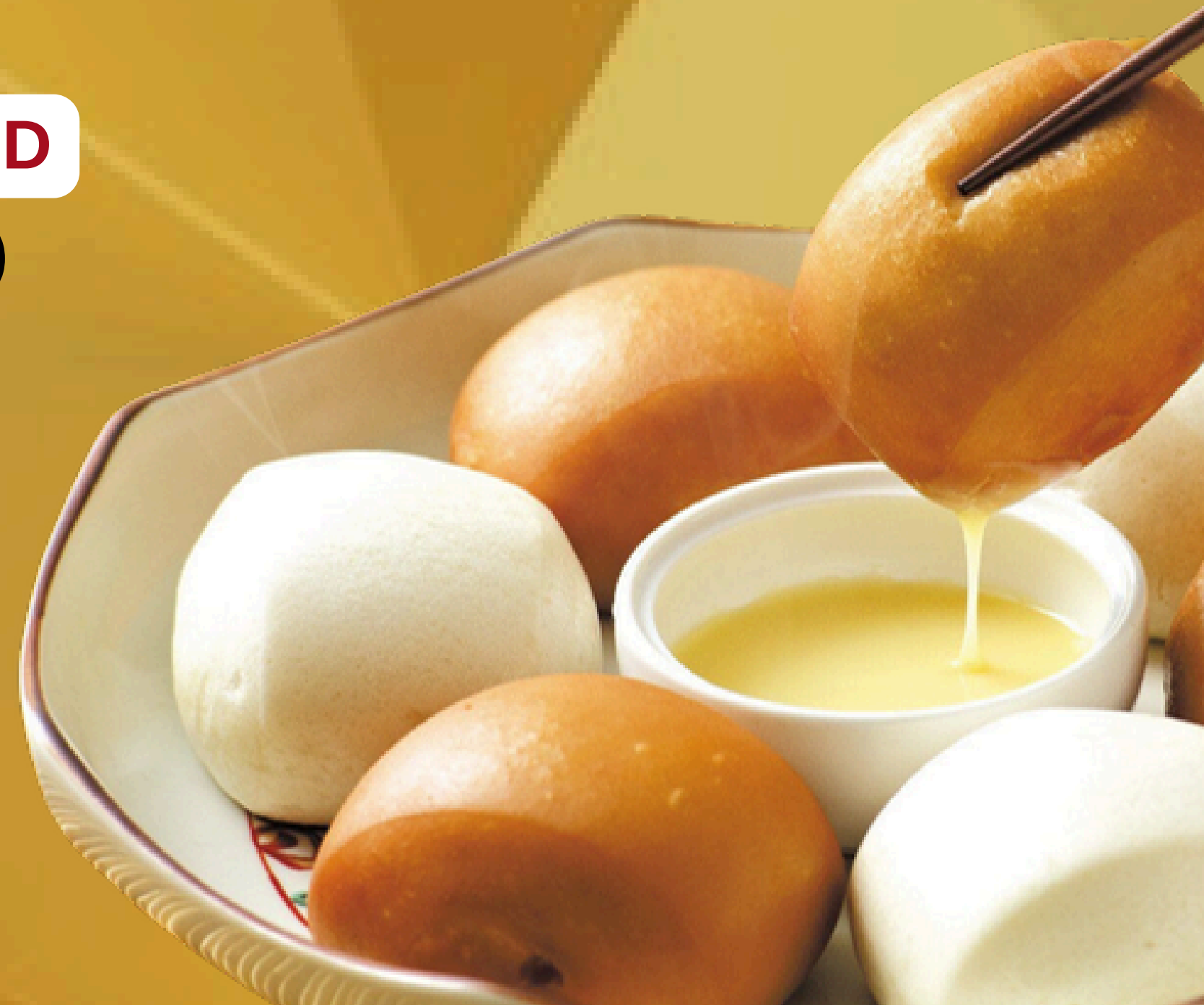
金銀小饅頭 SP Steamed & Deep Fried Buns (6)