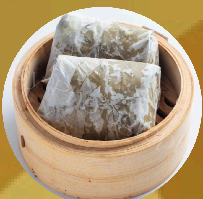
D 鮑汁瑤柱珍珠雞 Steamed Glutinous Rice, Dried Scallop, Chicken Mince, Mushrooms (2pcs)