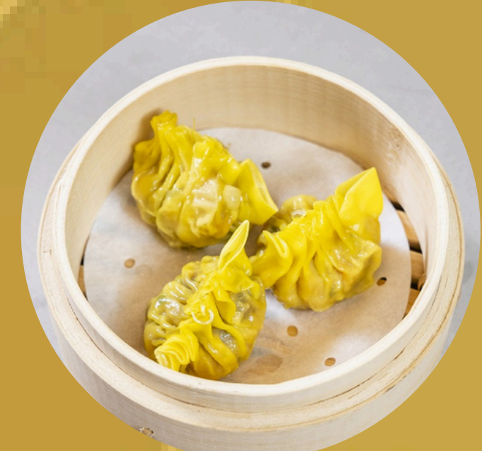
C 魚翅餃 Prawn & Pork Dumplings (3pcs)