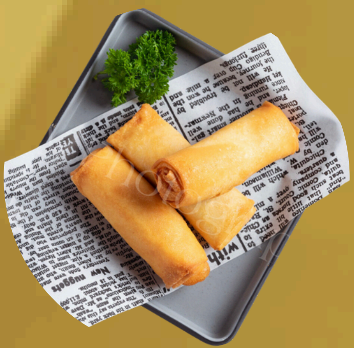
蔬菜春卷 C Vegetable Spring Rolls (3)