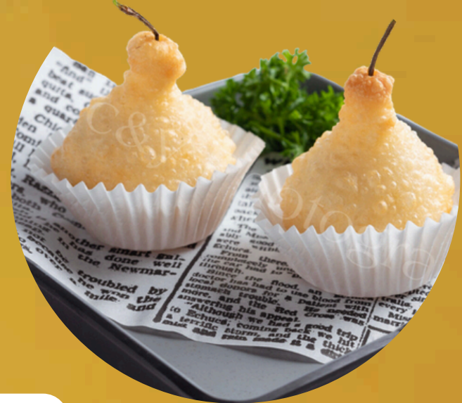
C 啤李咸水角 Pear Shape Deep Fried Glutinous Dumplings (2pcs)