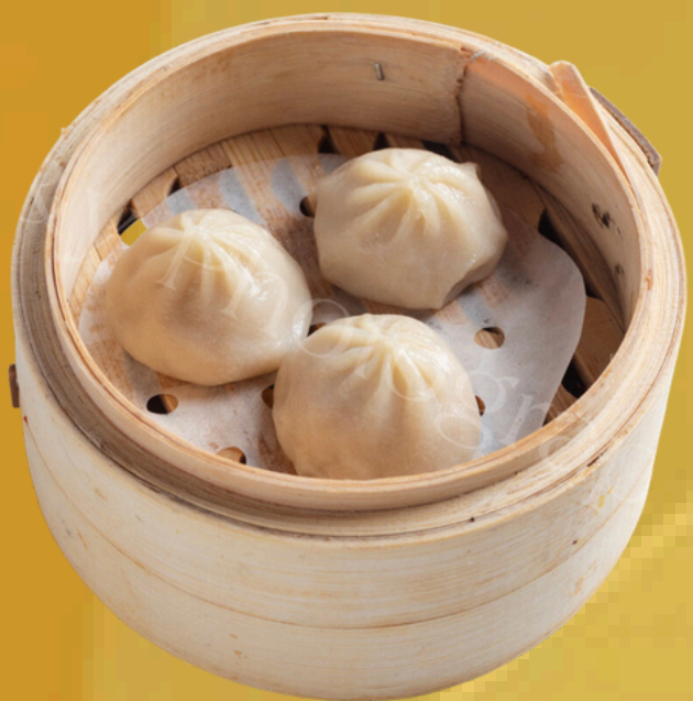
C 上海小籠包 Steamed Shanghai Pork Dumpling (3pcs)