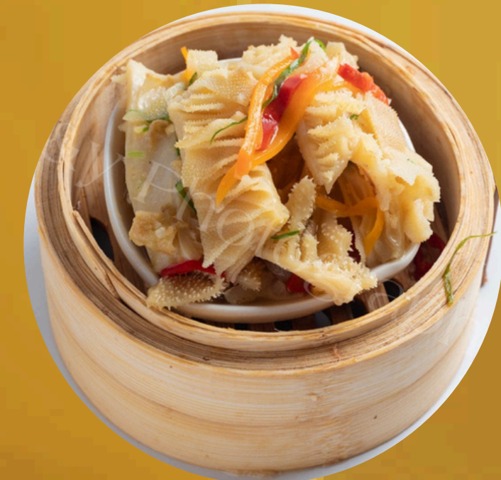
D 薑蔥牛柏葉 Steamed Omasum, Ginger Shallot