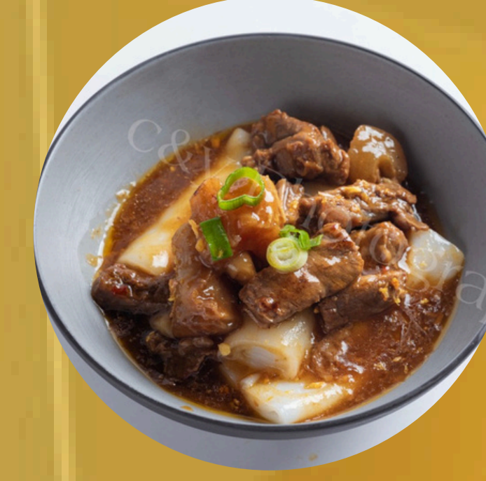
牛腩撈腸粉 SP Steamed Rice Noodle Roll with Beef Brisket