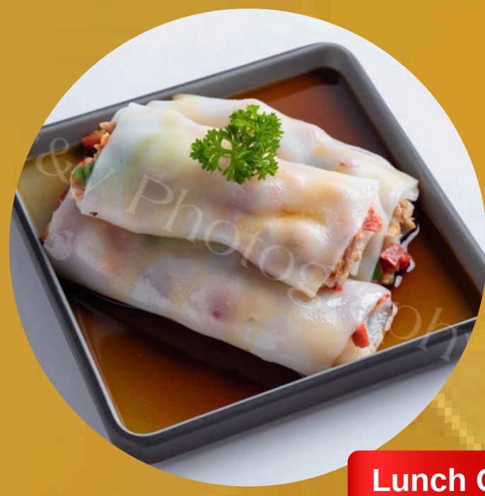
牛肉腸粉 SP Steamed Rice Noodle Roll with Minced Beef