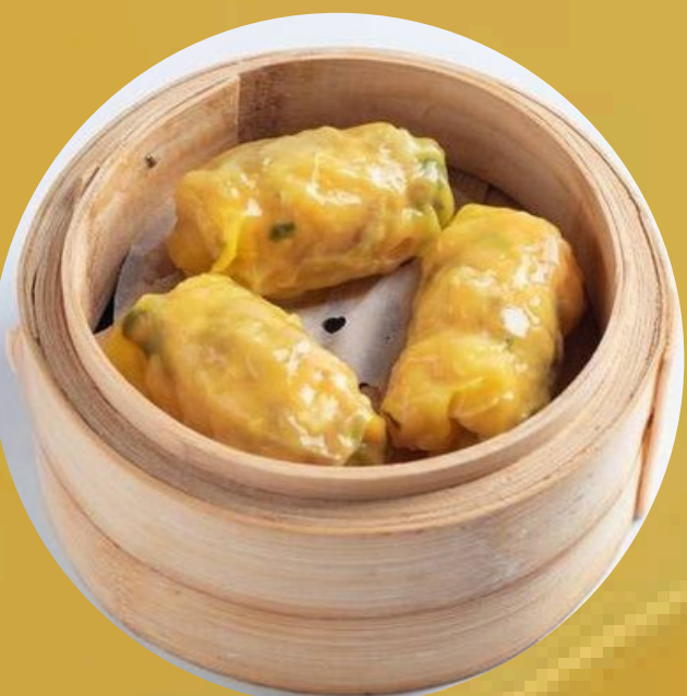
D 鴨肉蝦餃 Duck Meat & Prawn Dumplings (3pcs)