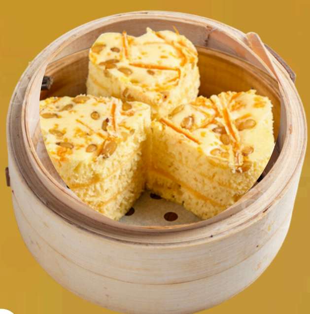
C 千層馬拉糕 Spongy Cake w/ Salty Egg & Pine Nuts (3pcs)