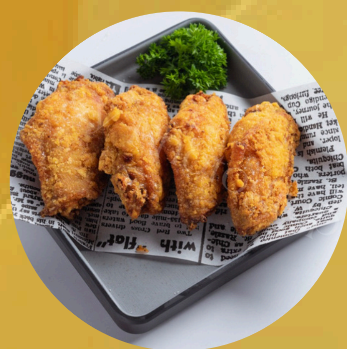
D 秘製雞翼 Deep Fried Chicken Wing (4pcs)