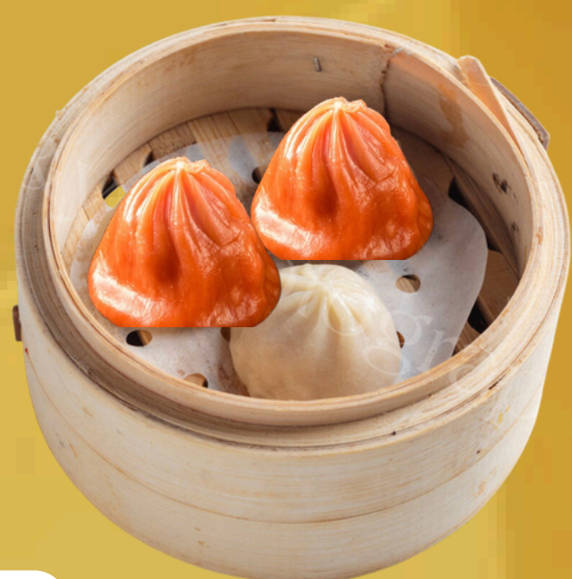
C 麻辣小籠包 Steamed Spicy Pork Dumpling (3pcs)