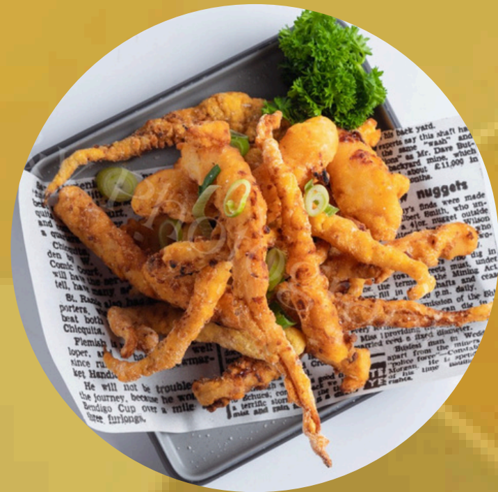
港式魷魚鬚 $14.30 Salt & Pepper Squid