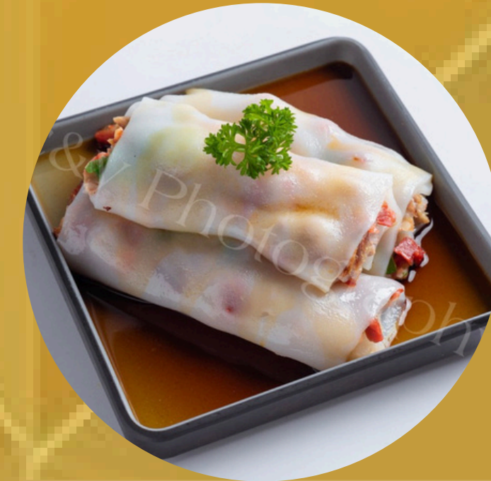
叉燒腸粉 SP Steamed BBQ Pork Rice Noodle Roll