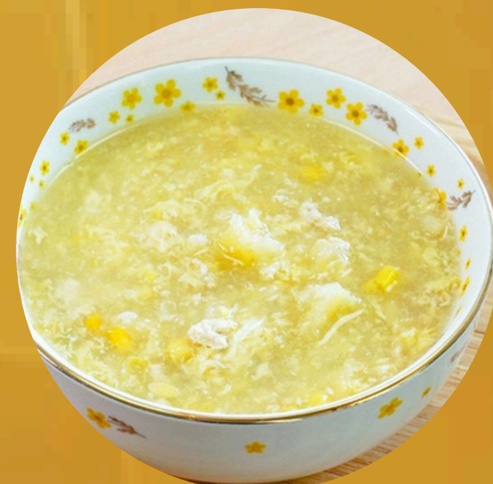
SP 粟米雞湯 Chicken Sweet Corn Soup