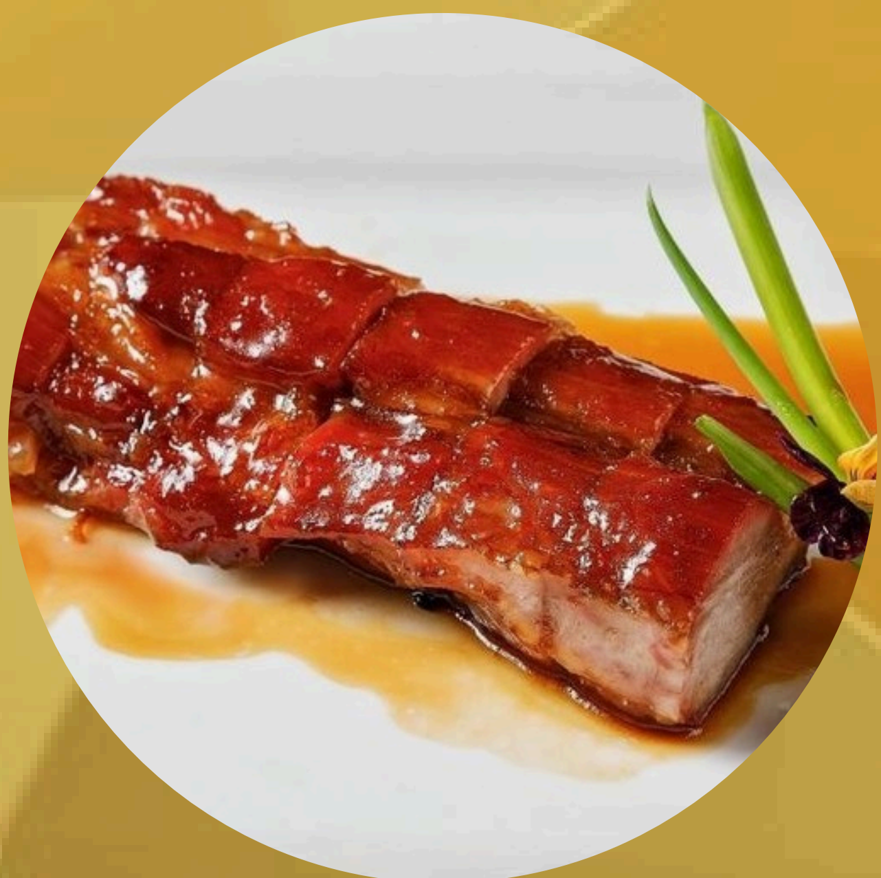
如意叉燒皇 Signature BBQ Pork Belly

All BBQ - One Meat $19.8/ Serve, Two Meats $23.8 (Yum Cha Portion)