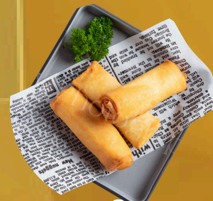
蒜蓉蝦春卷 D Deep Fried Prawn Spring Rolls (3)