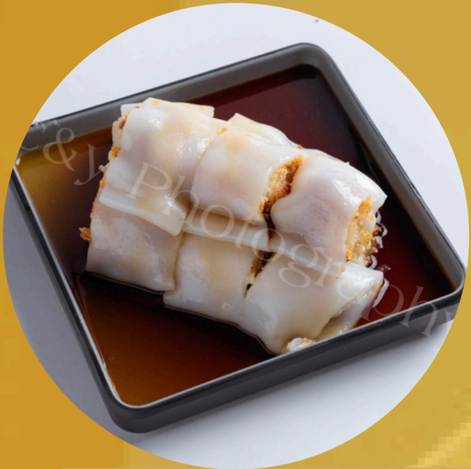
脆脆海鮮腸 SP Steamed Rice Noodle Roll with Crunch Seafood Stick