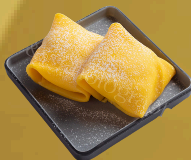
SP 芒果班戟 Mango Pancake (2pcs)