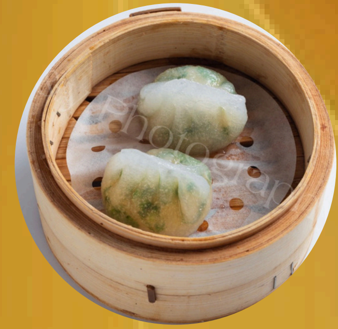
A 水晶韭菜餃 Prawn & Chive Dumplings (2pcs)