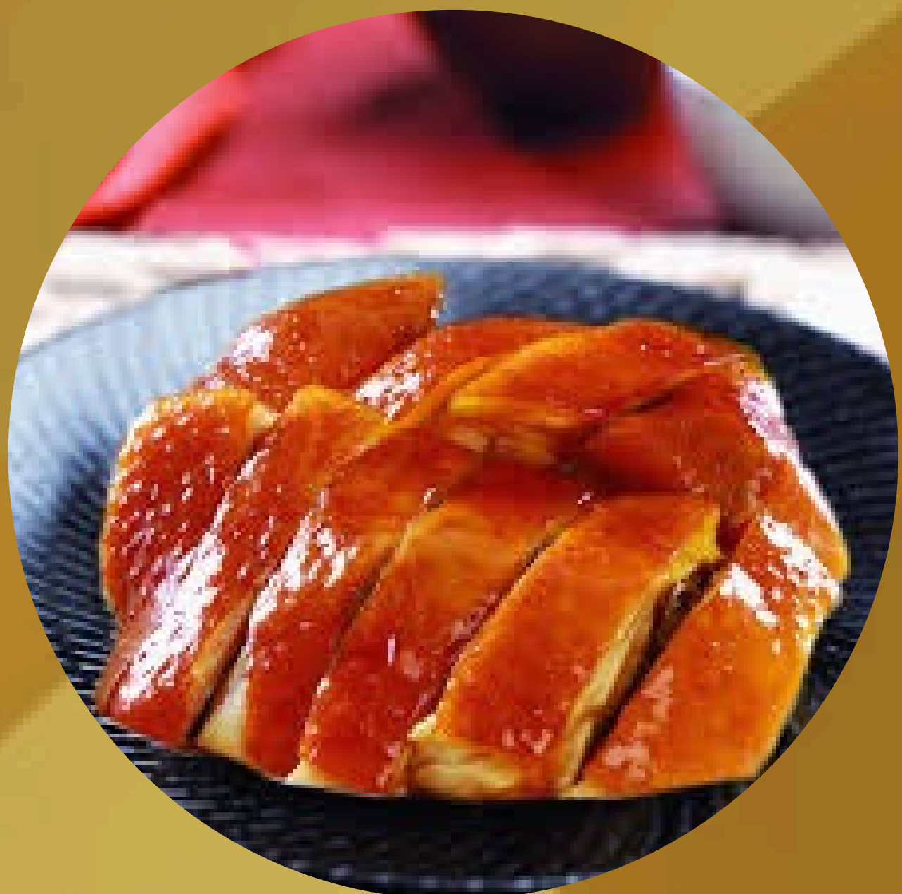
明爐燒鴨 Roasted Duck