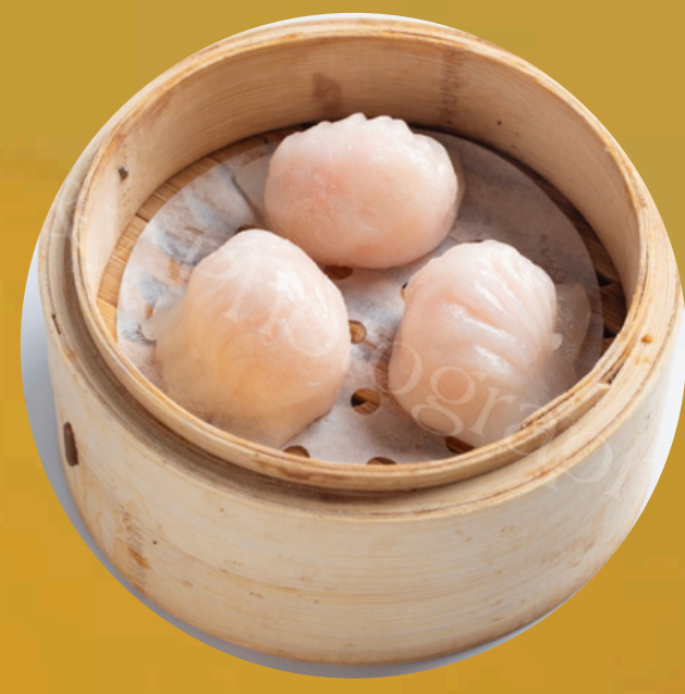
D 水晶蝦餃 Prawn, Water Chestnut Dumpling (3pcs)