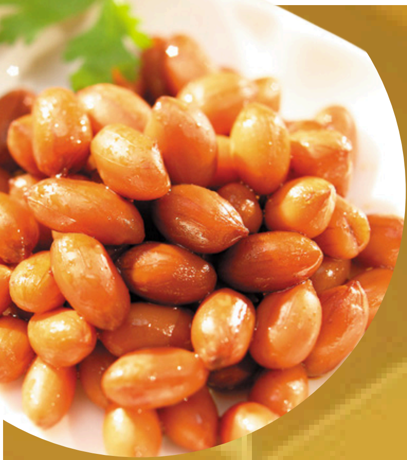
D 滷水花生 Marinated Peanut