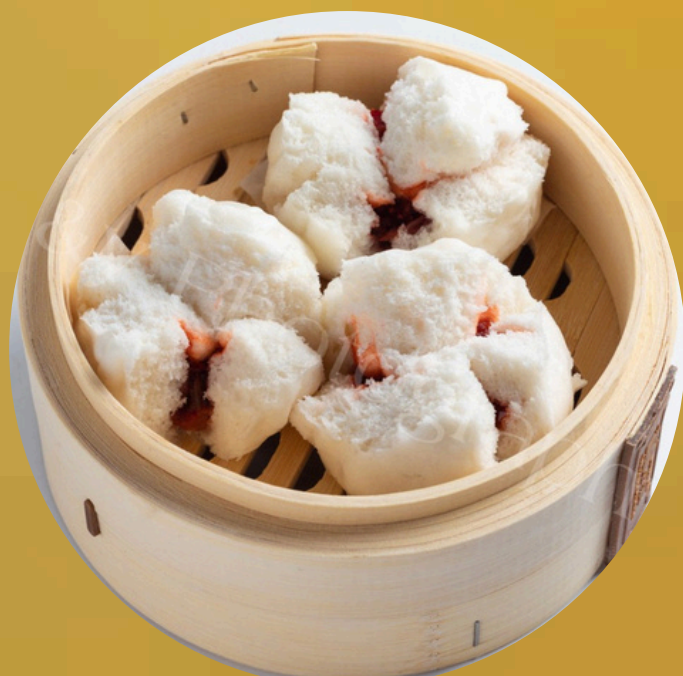
D 蜜汁叉燒包 Steamed Barbeque Pork Buns (3pcs)