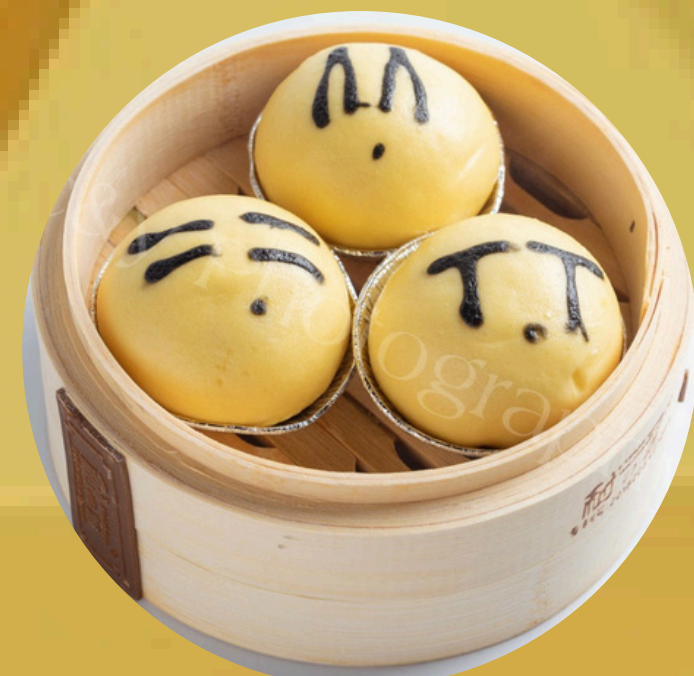
D Emoji流沙包 Emoji Salted Egg Custard Buns (3pcs)