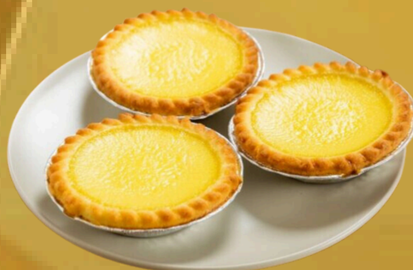
一口蛋撻 D Egg Tart (3)